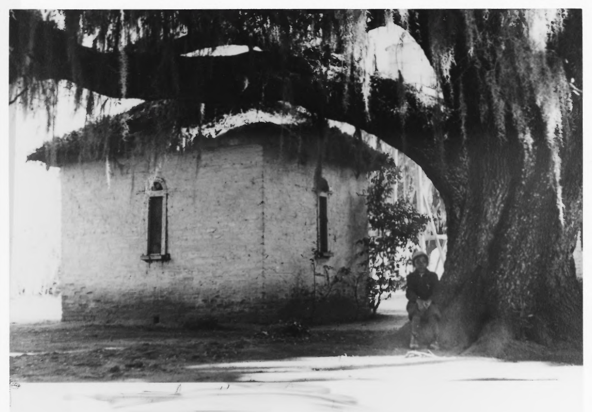
The Dairy at Word Pands - Still standing