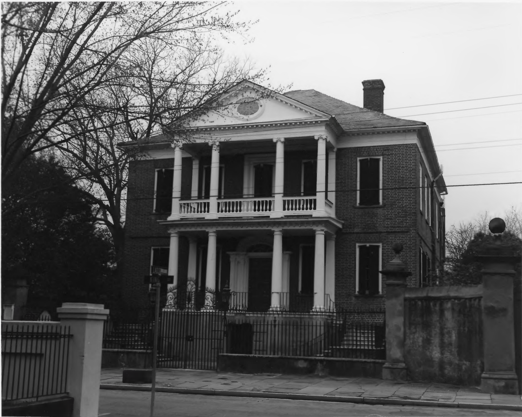
Miles Brewton House, Charleston, South Carolina