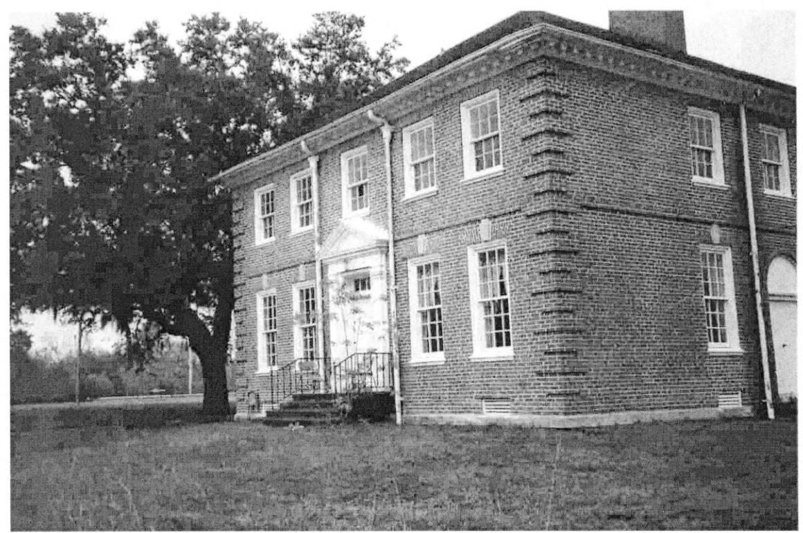
View of boy's dormitory from the southwest. Photograph by Caridad de la Vega, December 2005.

View of front façade from the northwest. Photograph by Caridad de la Vega, December 2005.