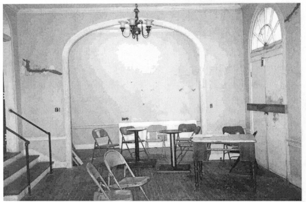
View of first floor sitting room. Photograph by Caridad de la Vega, December 2005.