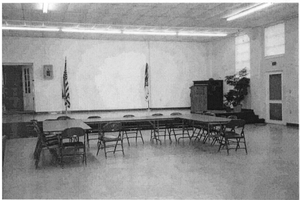
Interior view of auditorium/cafeteria on first floor from the southeast. Photograph by Caridad de la Vega, December 2005.

View of rear façade with addition, from the south. Photograph by Caridad de la Vega, December 2005.