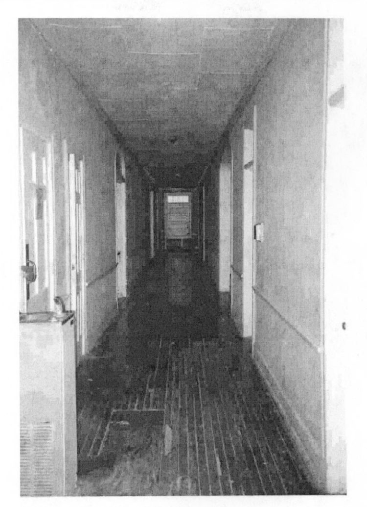
Interior view of first floor corridor. Photograph by Caridad de la Vega, December 2005.