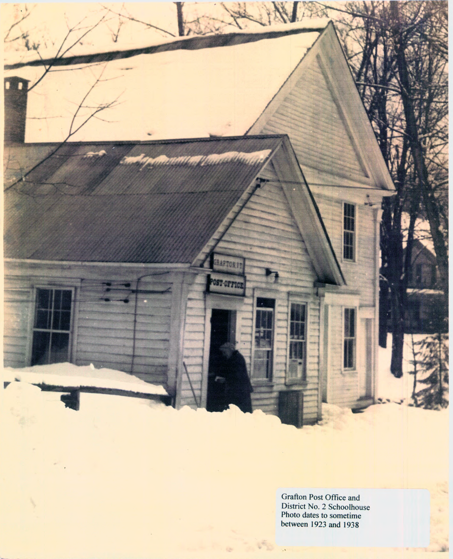
Grafton Post Office and District No. 2 Schoolhouse Photo dates to sometime between 1923 and 1938