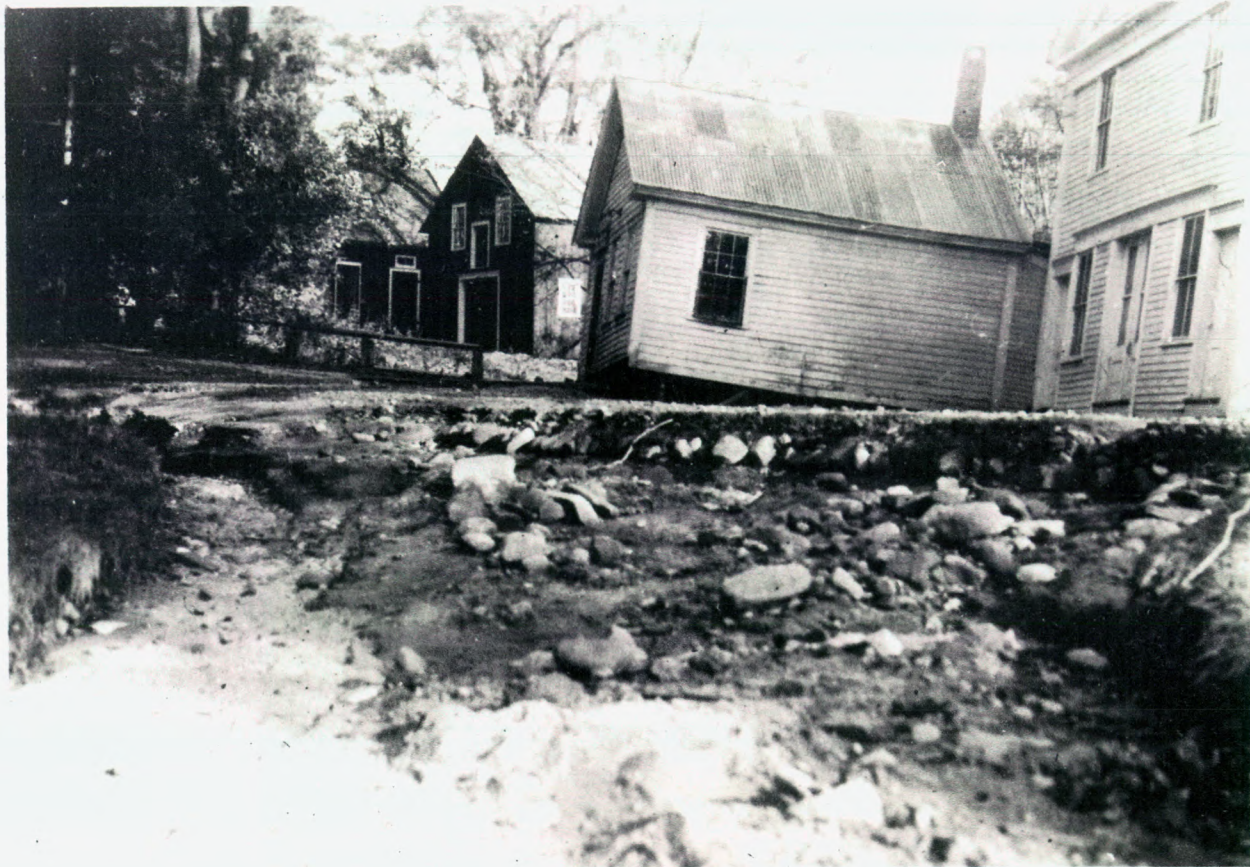
Grafton Post Office and District No. 2 Schoolhouse After 1938 hurricane