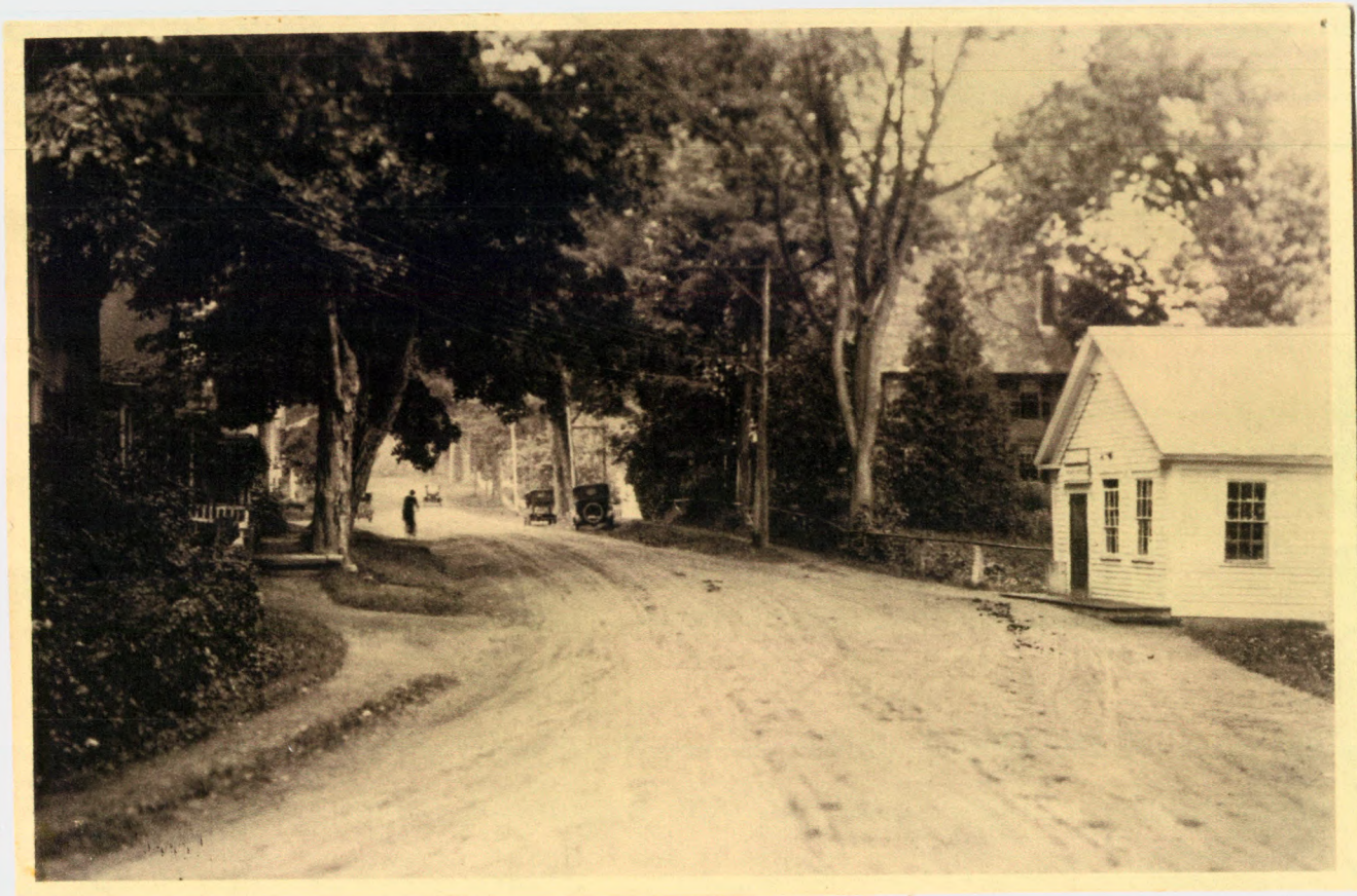
Grafton Post Office, c. 1930s