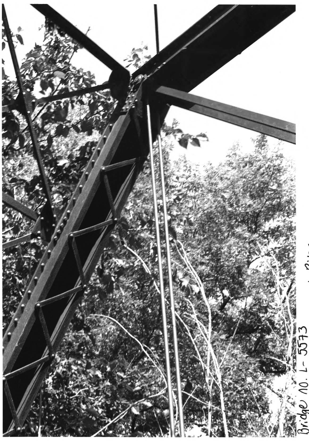
Bridge 10. L-5573 Two. Rd. 95 over The Straight River 5 Tee LP (0., Mn 07025-54