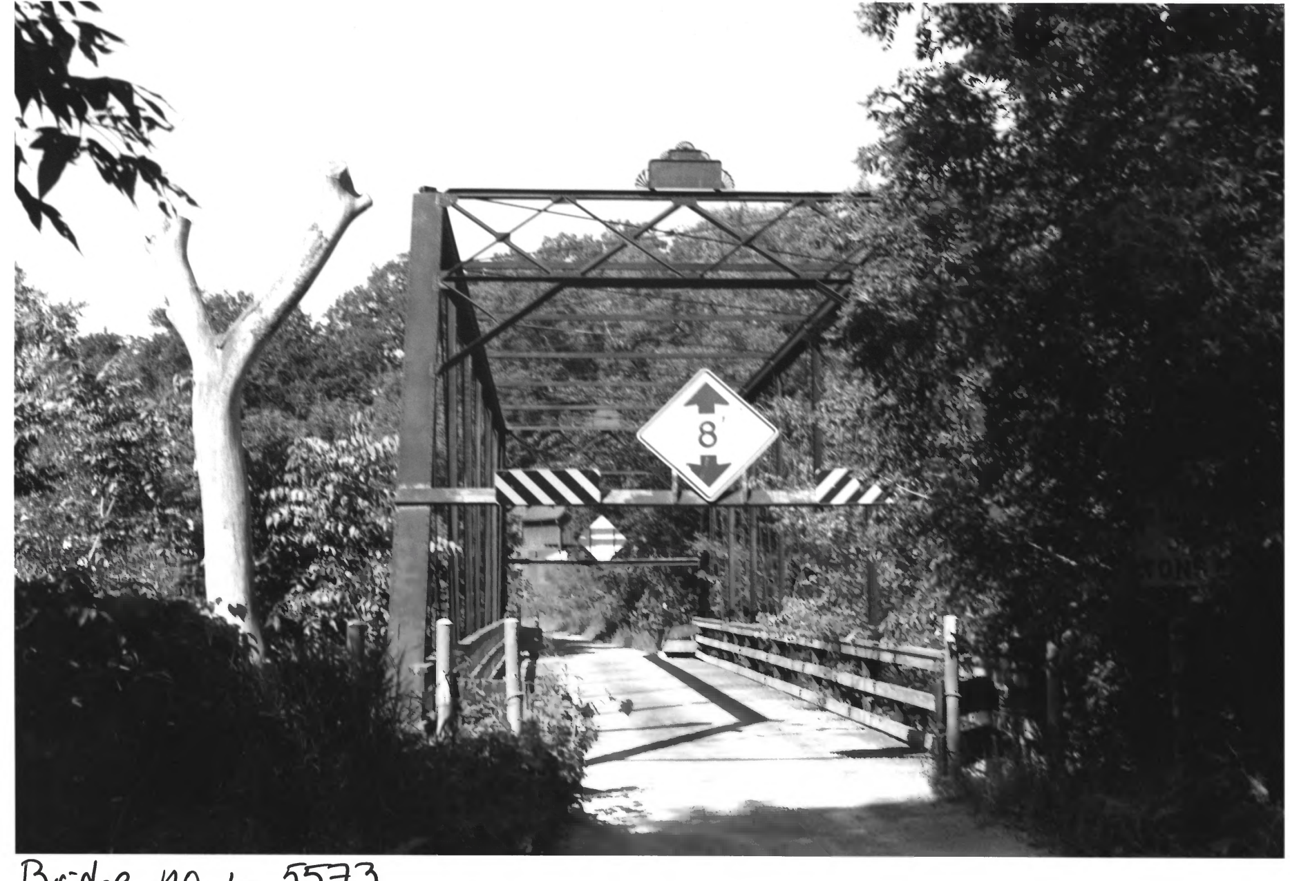
Bridge NO.L-5573 TWP. Rd. 95 Over The straight River Steele Co., mn 07223-3A