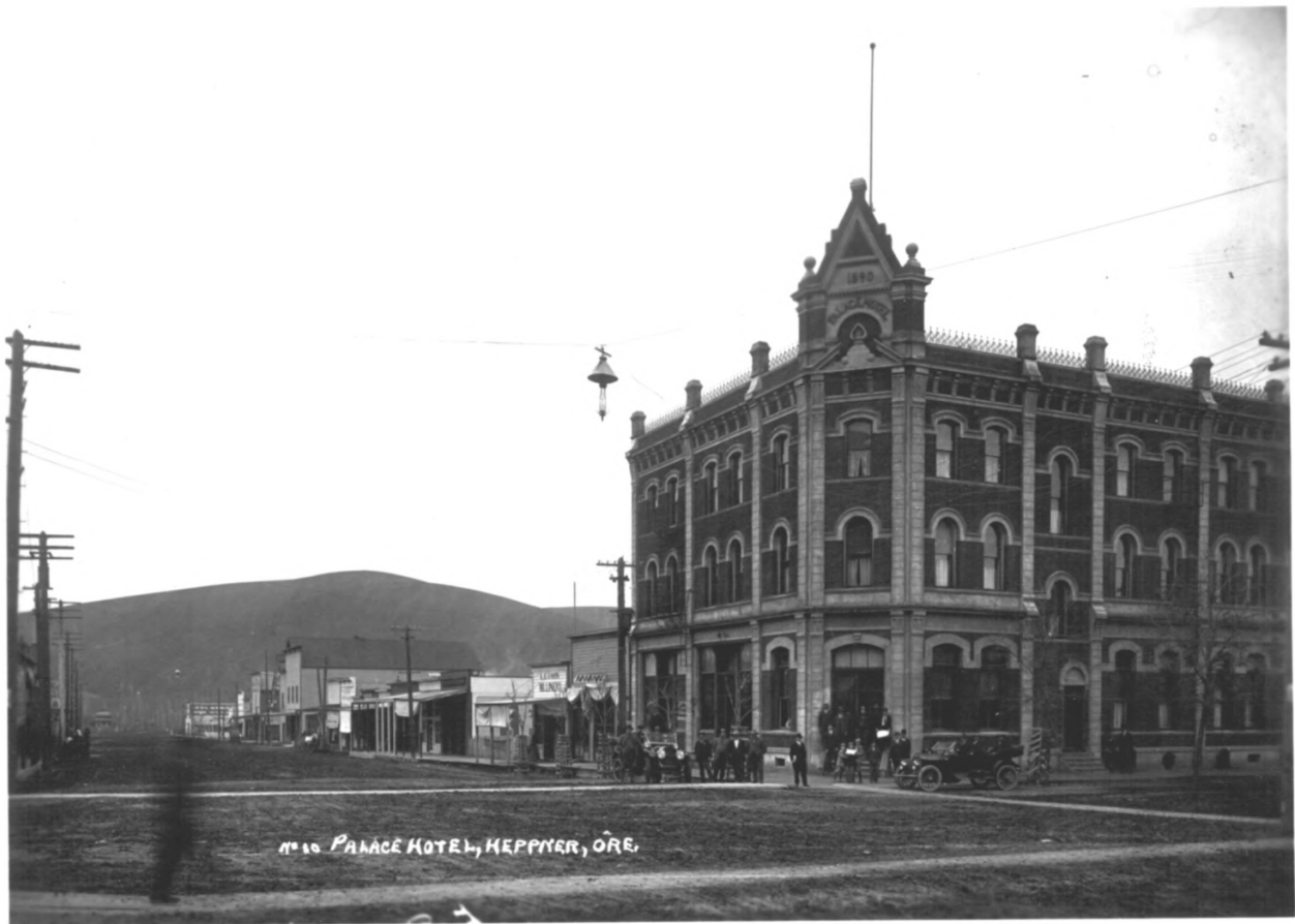
No. 10 PALACE HOTEL, HEPNER, ORE.