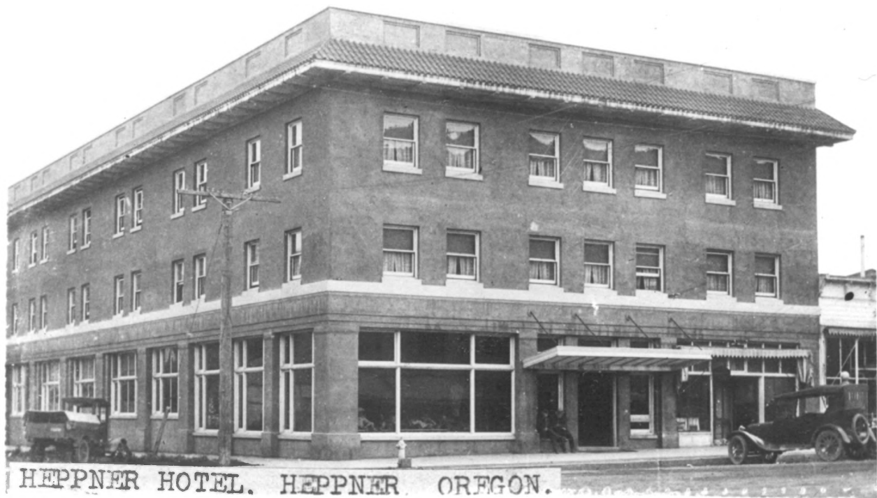
HEPPNER HOTEL. HEPPNER. OREGON.