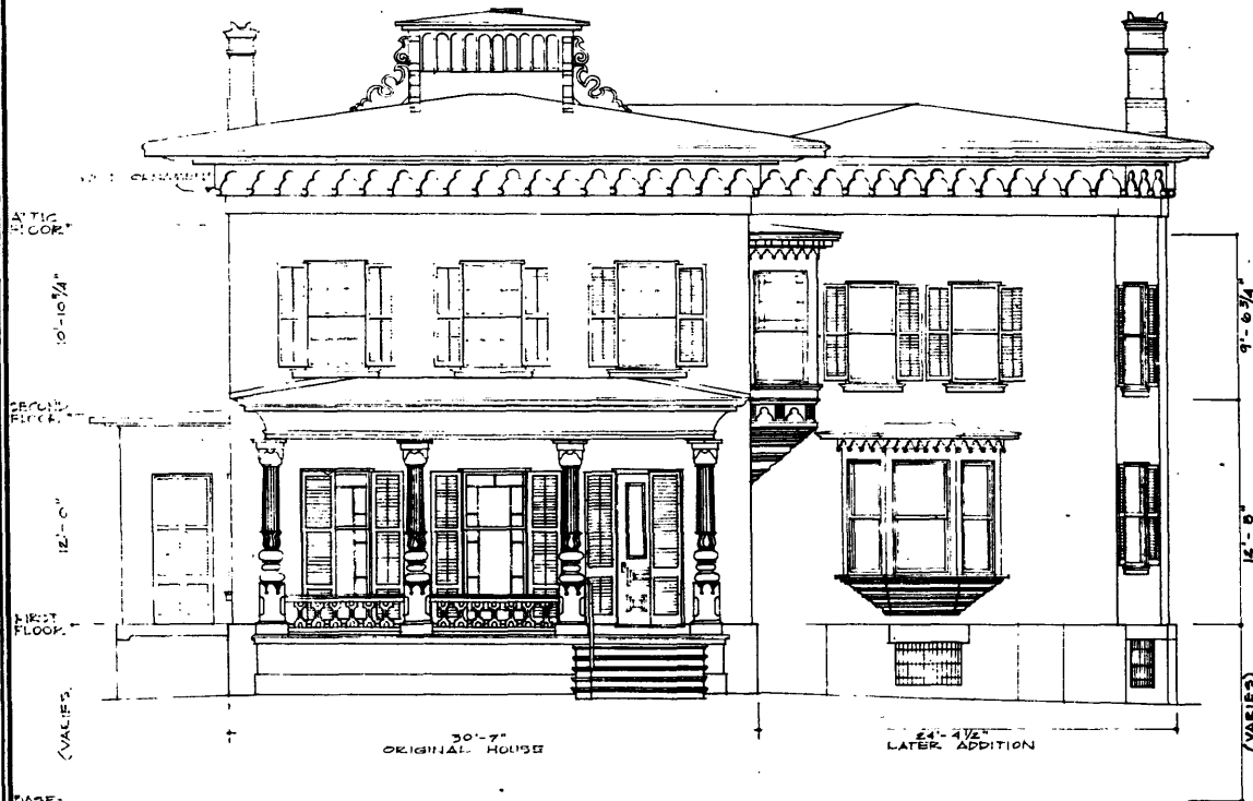
EAST ELEVATION SCALE ~ \frac{3}{16}'' = 1'-0''