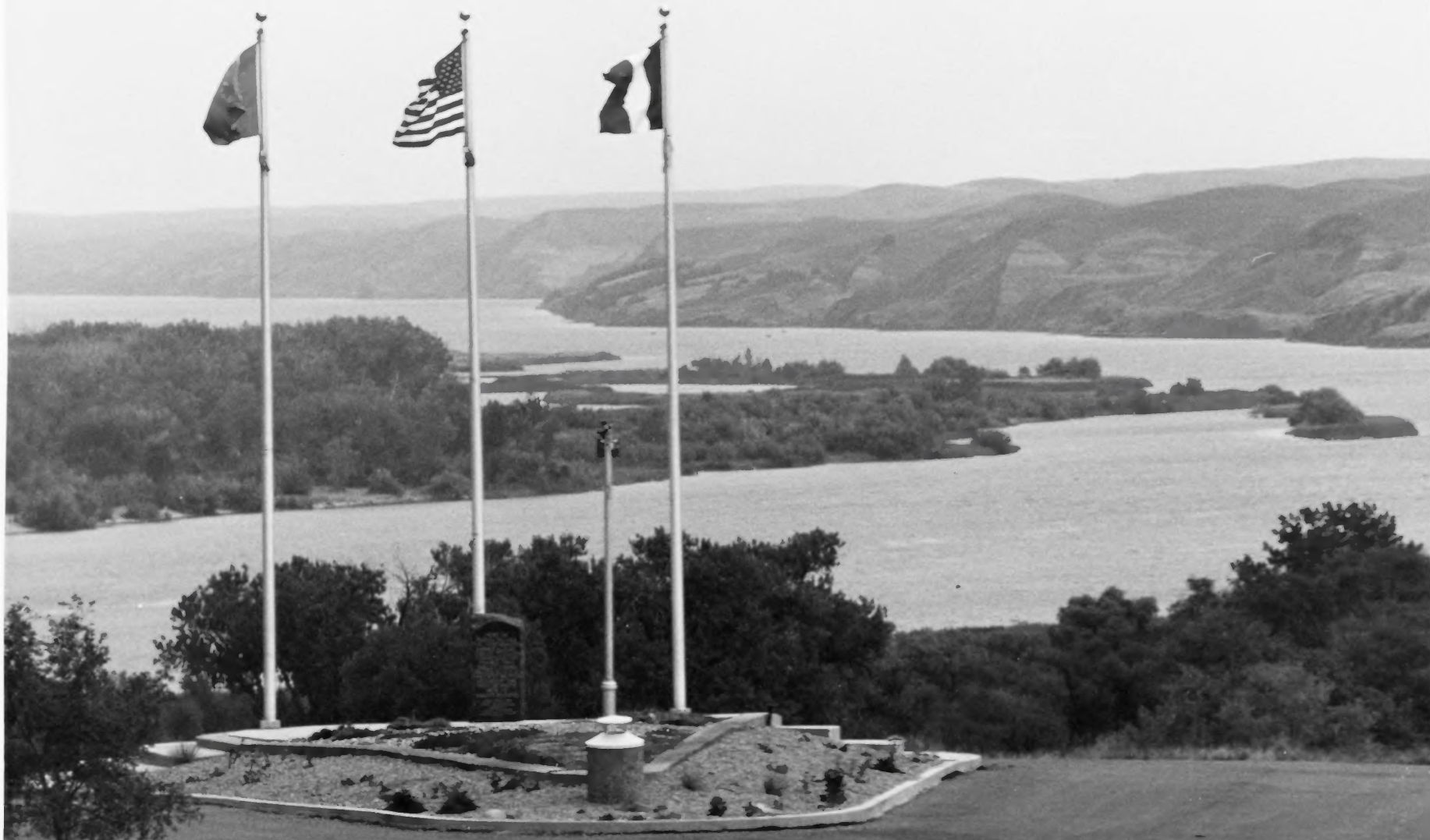
Verendrye Site, Fort Pierre, South Dakota Verendrye Hill, from NW