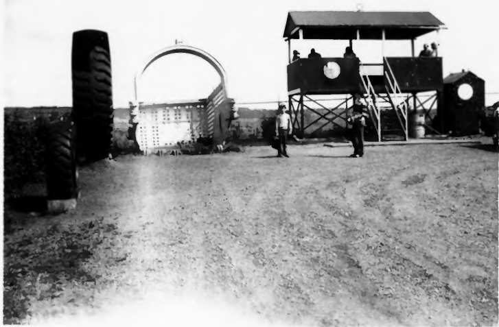
Viewing platform near Hibbing, MN.