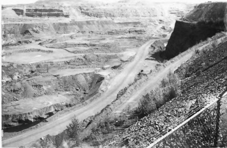
View from observation platform