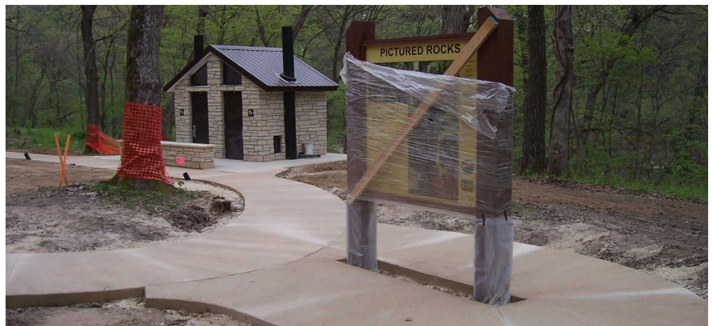
Recent improvements to the Jones County Water Trail at "Pictured Rocks" area along the Maquoketa River.

Assist local leadership to build a broad base of support for the project. Provide technical assistance with project phasing, scope of work, selection of river access areas, mapping, and general community involvement.