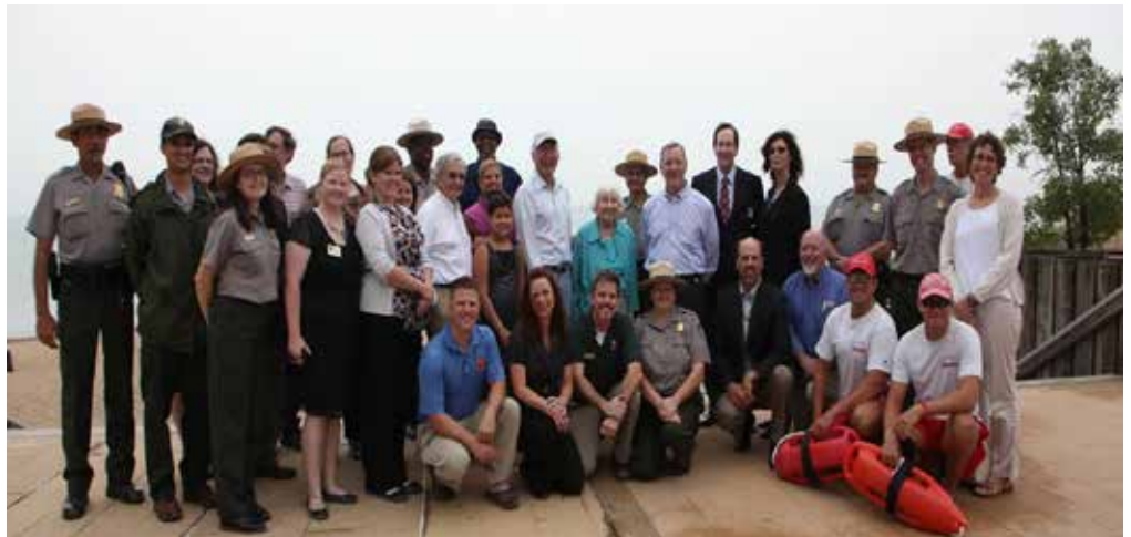
Lake Michigan Water Trail advocates.

City of Indianapolis is undertaking a feasibility study to become a Groundwork Trust.