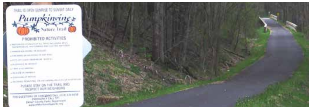
Pumpkinvine Nature Trail.