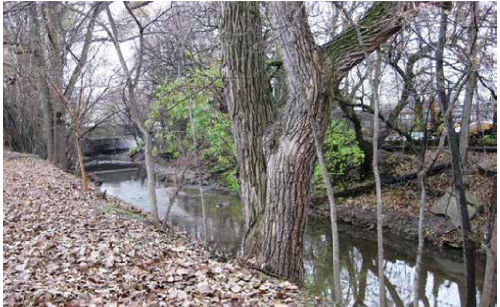
Pogue's Run near downtown Indianapolis.

Reconnecting to Our Waterways (ROW) is a grassroots movement with a goal to help neighbors strengthen waterways, and help waterways strengthen neighborhoods. ROW is housed at Keep Indianapolis Beautiful, Inc. and includes key players from the City of Indianapolis, anchor institutions from across the city, and local neighborhood organizations that serve as a steering committee. The effort is focused on six primary elements for each waterway: aesthetics, economy, ecology, connectivity, education, and well-being.