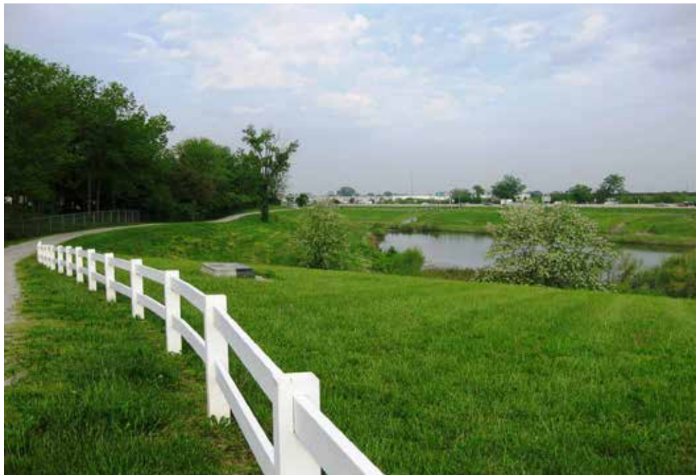
Pogue's Run Basin and Trail in Indianapolis.