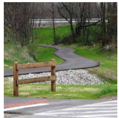
The recent opening of the Pumpkinvine Nature Trail in Middlebury, Indiana adds another piece to Northern Indiana Trails.

Trail development across northern Indiana has been so successful at the regional and local level, that there is now an opportunity to begin