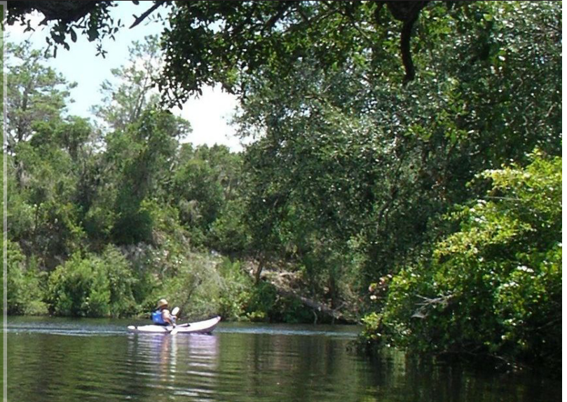
Kayaking along the Manatee River, Florida