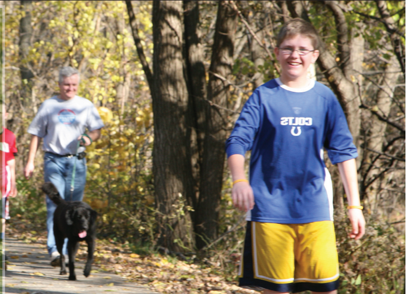
Families enjoy getting out on the trail.