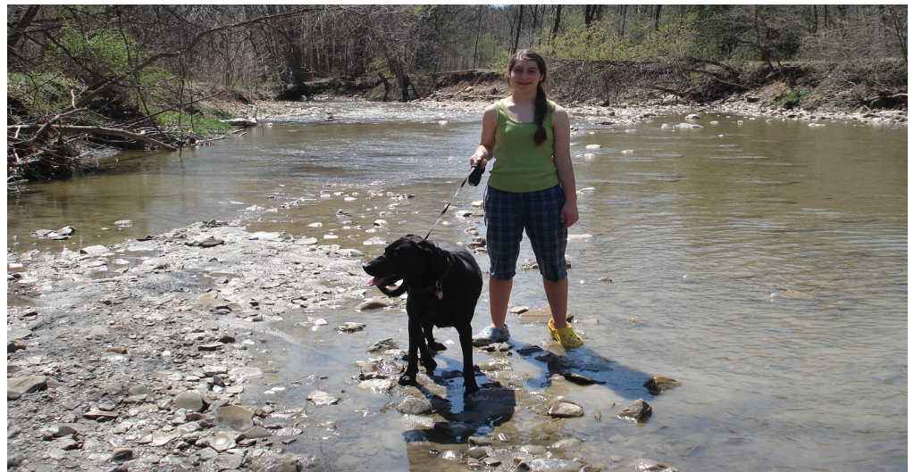
Exploring Cuyahoga Valley National Park