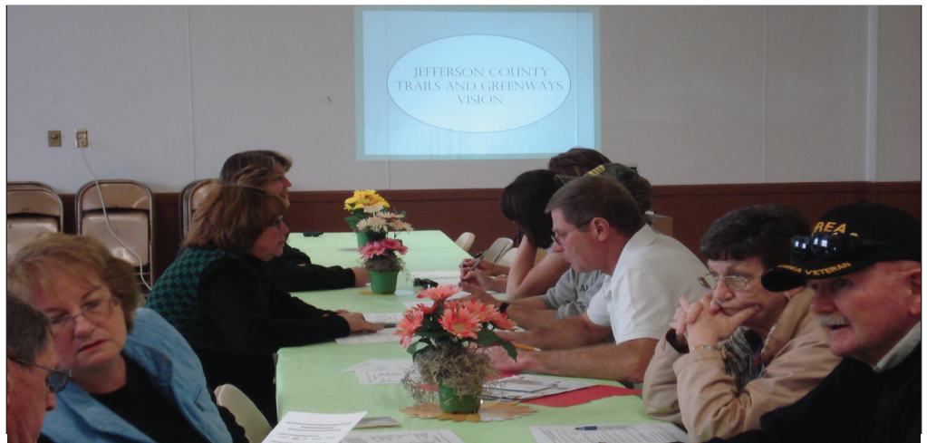
Jefferson County Trails and Greenways Vision

Facilitate meetings with stakeholders, bringing together various partners with their individual projects to accomplish a shared goal of protecting greenspace, water resources and building recreational opportunities. Conduct neighborhood meetings to provide information and seek public input.