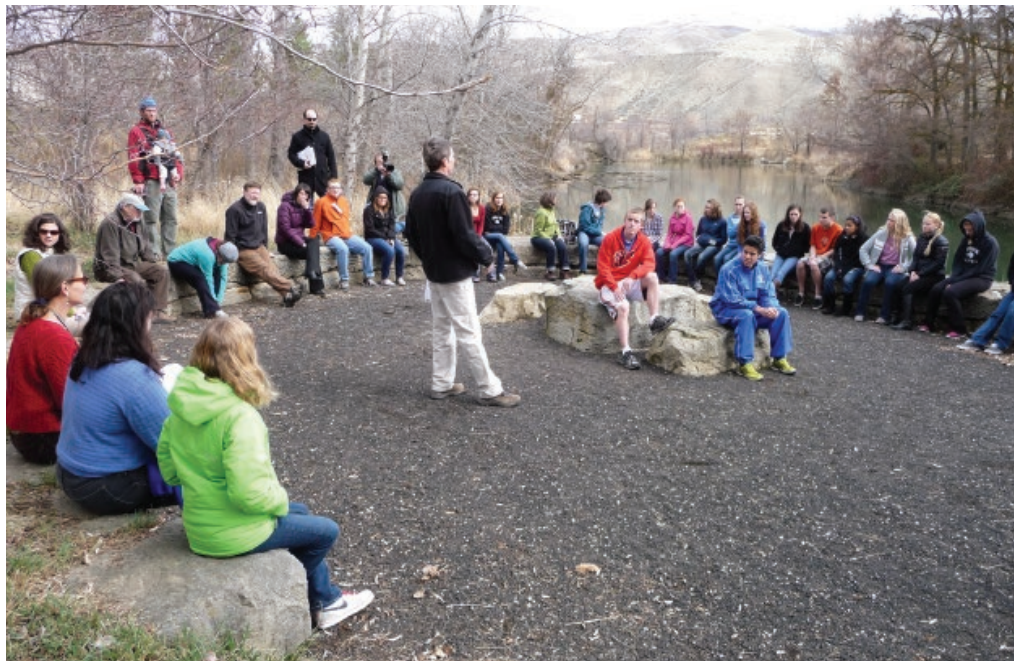
Students, teachers, land managers, and local resource experts gather at the Idaho Shakespeare Festival's storytelling circle to exchange information about Barbar Pool Conservation Area.

In June, project partners were surprised to learn there would be an opportunity to present their team designs to the Foundation's Board of Directors. Two students volunteered for the chance to reach out to the Conservation Area managers, eloquently describing the reasoning behind their designs. For most students this interactive community project was an exciting, unusual assignment about a nearby special place. For others, it was a chance to make a difference - not only for a trail they could now envision - but in a potential new career that might influence the world around them.