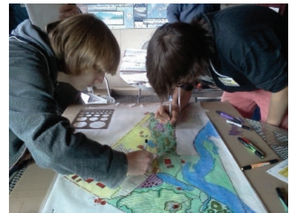
Youth design an educational trail through a section of the Barber Pool Conservation Area.

In March 2012, RTCA helped launch a community design project where 75 students from three schools met with local resource experts to develop ideas for the Barber Pool Conservation Area Interpretive Trail. Idaho Foundation for Parks and Lands provided the context for the project: a small parcel of land between the Boise Greenbelt and the Boise River. Timberline High School, East Junior High, and Riverstone International School contributed a trio of dynamic teachers and classes of inquisitive students. Local land managers, resource experts, adjacent land owners, and design professionals from the Idaho-Montana Chapter of the American Society of Landscape Architects rounded out the project.