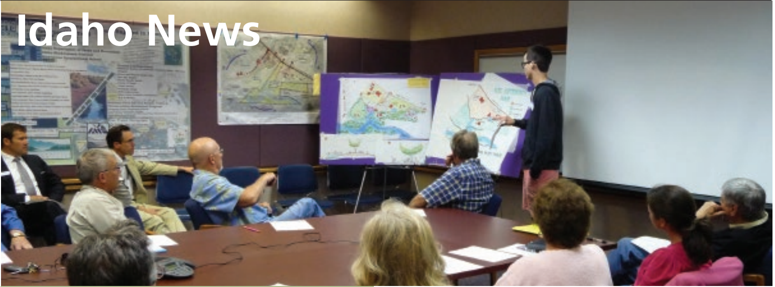
A Riverstone International School student presents trail design concepts to Idaho Foundation for Parks and Lands' Board of Directors.