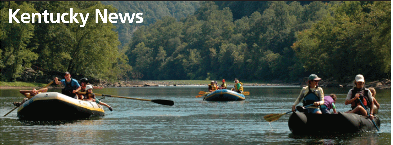
Rafting on the Kentucky River.