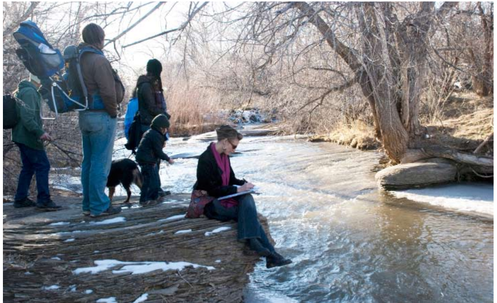
Improvement of the Cucharas River corridor will allow families to experience close-to-home natural resources and recreational opportunities

Coordinate between multiple organizations to compile existing information regarding regional conservation priorities and develop alternative trail alignments that accomplish county-wide recreational goals.