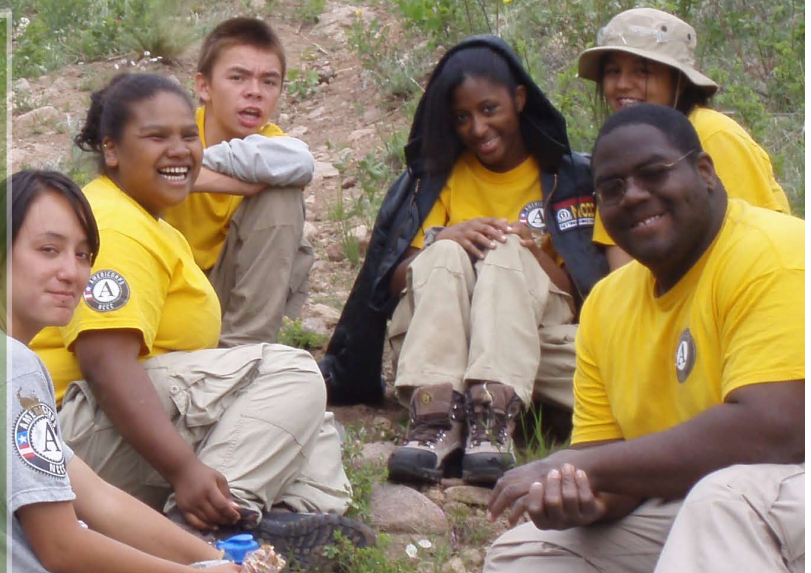
AmeriCorps NCCC crew in Pike National Forest