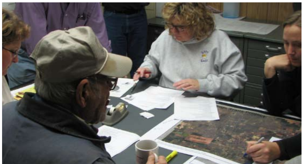
Community members help identify historic resources in Kiowa County

Work with partners to identify which community-identified heritage resources will be connected via recreational trails and driving routes and develop trail alignment alternatives based on community-defined criteria. Identify and engage other resource experts for interpretation and preservation needs.