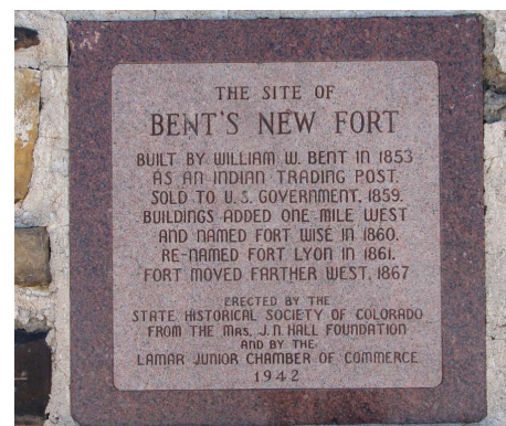
Bent's New Fort plaque

The Bent's New Fort site was awarded a grant from the Colorado Historic Fund to conduct a professional archeological assessment of the area. This assessment, in conjunction with the local designation of historical significance, will lead to a nomination of the site for the National Register of Historic Places.