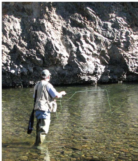
Fly fishing on the Lake Fork of the Gunnison River

Help the Lake Fork Valley Conservancy develop a collaborative plan to guide project partners in reaching their goal to improve the ecological function and enhance recreation opportunities. Conduct community involvement in cooperation with project partners and target outreach to landowners, boating, fishing, and environmental interests and other stakeholders.