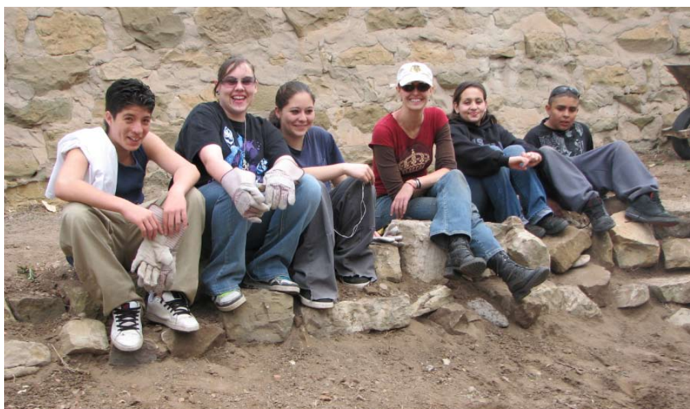
Walsenburg youth relaxing on the rockwall they built for the Cucharas Riverwalk

In late April more than 80 local youth joined Huerfano County, youth sports groups, the Department of Social Services, Parks & Trails Advisory Group, and the National Park Service to complete the first of many steps toward a transformed Cucharas River experience in Walsenburg. Youth and crew leaders leveled out more than 1000 feet of trail, built a rock wall to prevent trail erosion, cleaned up trash in Fiesta Park, and eradicated the Russian Olive and Tamarisk invasive species near the river. The Cucharas Riverwalk is envisioned to offer Huerfano County residents and visitors a pleasant walk through picnic areas, amphitheater entertainment, and natural beauty. The trail will run just east of Fiesta Park along the Cucharas River to Bear Creek Road.