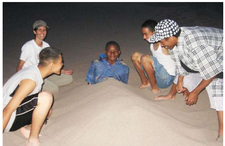
Groundwork Denver youth having fun at Great Sand Dunes National Park