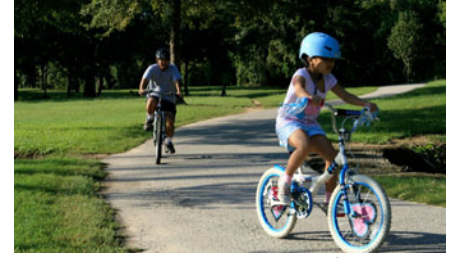
Existing Terry Hershey Trail exemplifies a bayou spine trail.

With RTCA support, the Energy Corridor District – a West Houston improvement district - recently approved the release of a visionary trail master plan for a 113,000-acre area bisected by I 10, at Houston's western edge. The plan is a result of a collaborative effort organized by the National Park Service and the Energy Corridor District partnership -- a variety of public agencies came together and shared data to develop an understanding of the value of creating connecting trails between the existing and proposed employment centers, residential communities, and the vast parks and public open spaces in West Houston.