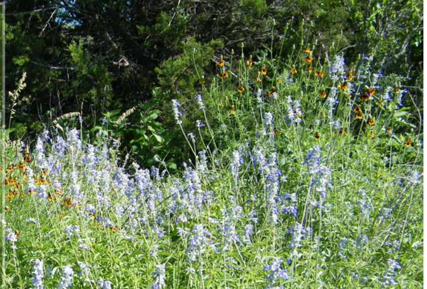
Wildflowers in Dahlstrom Ranch