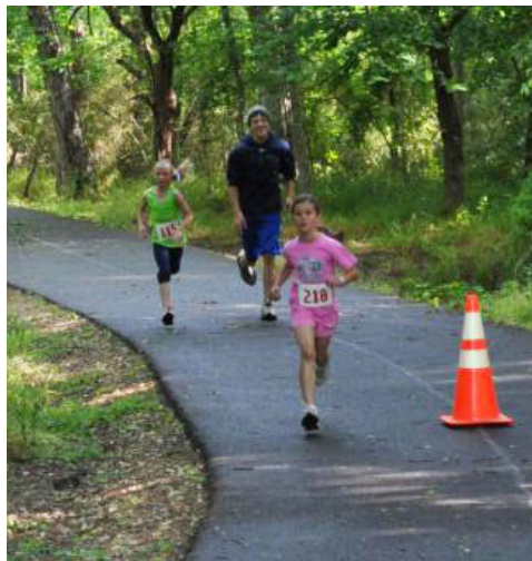
Youth marathon on an existing section of the NE Texas Trail.

Ensure the long-term integrity and sustainability of the 53-acre Headwaters Sanctuary, which includes