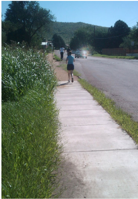
Runner in Alpine