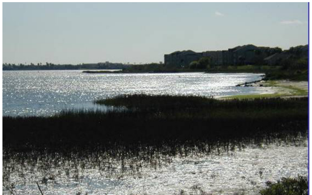
Oso Bay, Corpus Christi

Assist project partners with the development of a Paddle Trail Plan for Oso Creek.