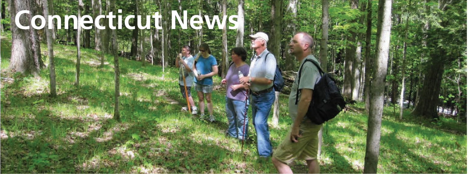
Hikers enjoying the Torrington Trails Network on National Trails Day.