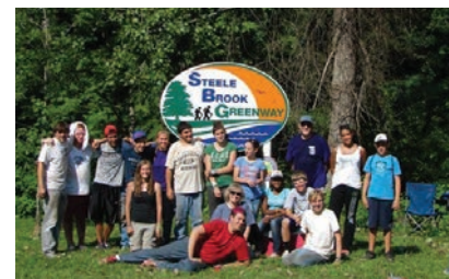
Proud volunteers after working on Steele Brook Greenway.

Help negotiate a transfer of rail corridor to the city for trail use; address drainage issues on the Buttrick Trail; develop trails on the John Brown property; and work with the Water Pollution Control Facility to allow multi-use trails on cleared sewer lines.