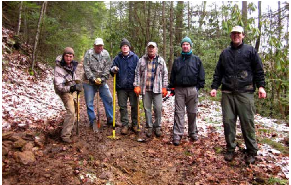
TuGuNu Hiking Club spends a great day doing volunteer trail maintenance at Twin Falls State Park, along the future route of the Great Eastern Trail!

- Joanna Swanson, Coordinator, Great Eastern Trail