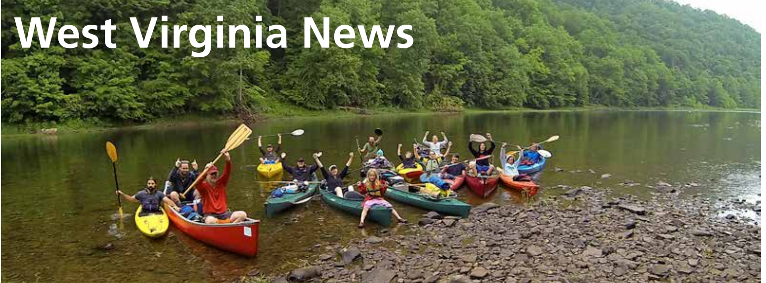
Western Maryland home school group on an overnight on the Cheat River Water Trail.