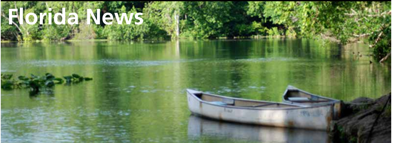
Lower Wekiva River, Florida.