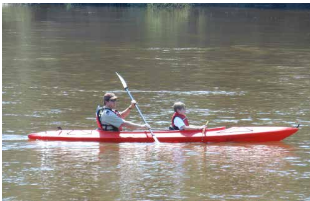
Kayaking down the Wekiva River.

Continue to work with partners on developing a conceptual plan for the greenway, possibly including a design of the trail system. Conduct community outreach and help with facilitating public meetings for the project throughout the year.