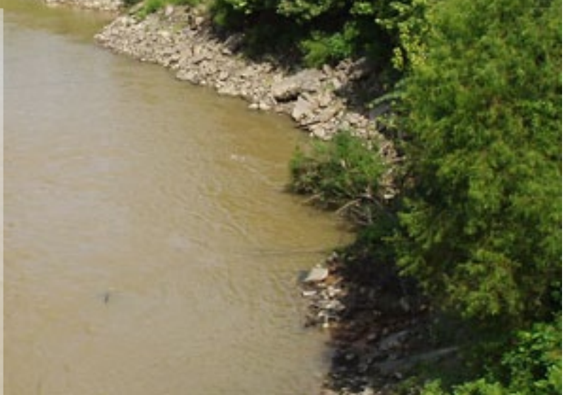
View looking downstream of the Forked Deer River, TN