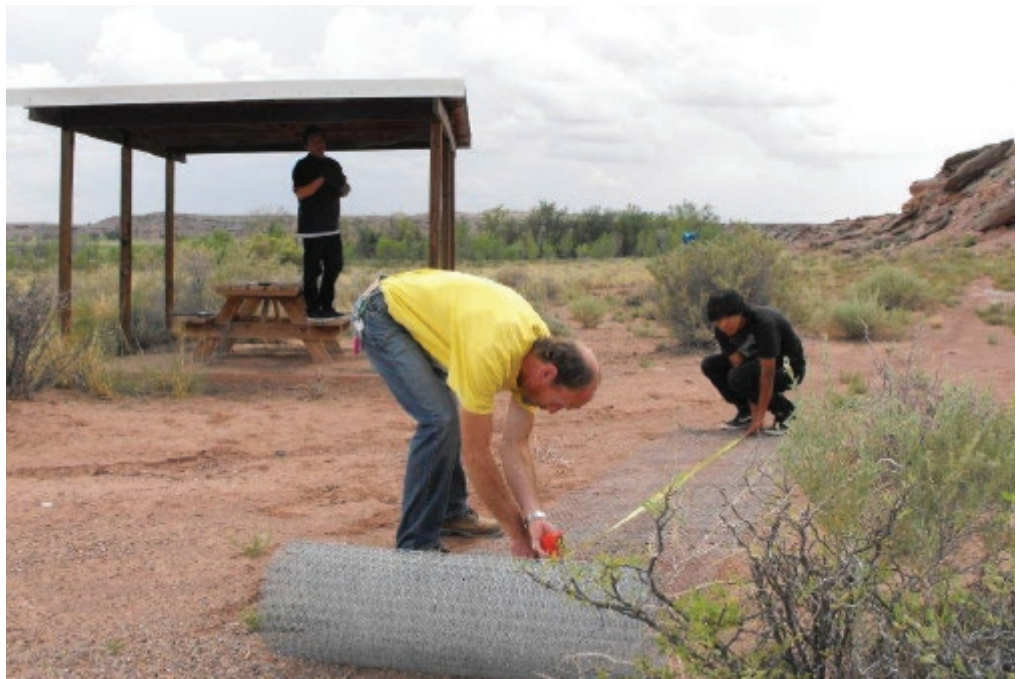
Holbrook community members measuring materials for ramadas at Hidden Cove Park.