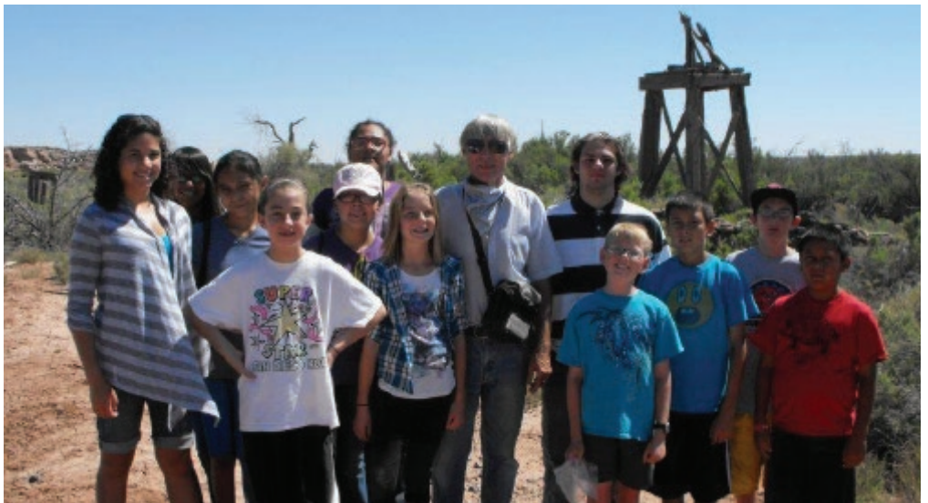
A group of local youth who volunteered at Hidden Cove Park.

Assist the City in implementing seven miles of trails, restoring riparian habitat, developing interpretive waysides, and preparing a park operations and management plan.