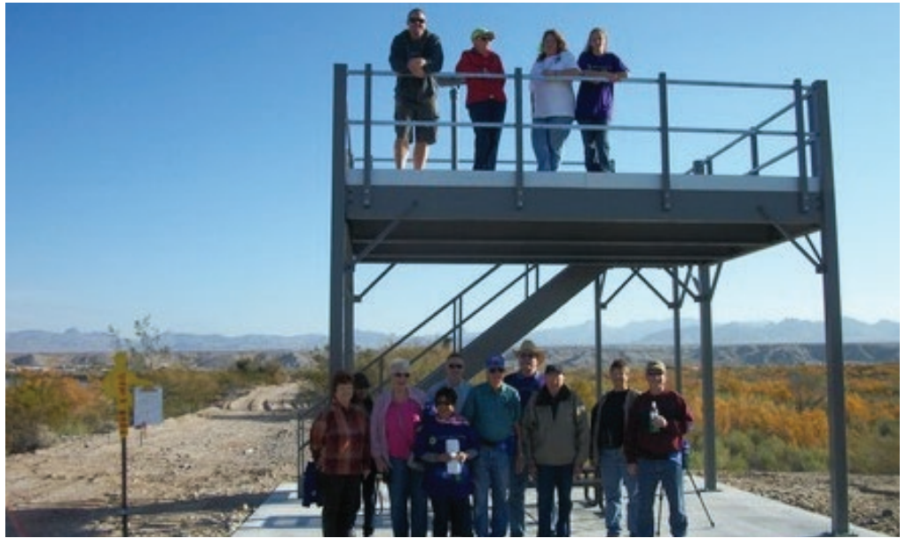
Contributors to Colorado River Nature Center on the observation deck.

Help to identify potential opportunities for restoration on County & City land, inform a broad range of citizens about restoration opportunities on public lands, identify funding (and other implementation strategies) for restoration projects on public lands, and develop strategies for keeping restoration projects a priority among the competing demands of County and City staff.