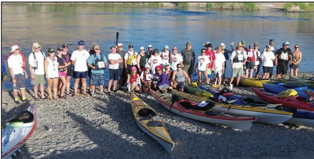
Participants line up for the 2011 Colorado River Regatta, With RTCA assistance, this stretch of river will hopefully become a designated National Water Trail. For more information on water trails, visit nps.gov/watertrails .

To provide a physical connection from the Monument Hill Trailhead to the Tres Rios Regional Trail. This connection will feature loop trail options, a permanent dock, parking, kiosks, walks, trails, sitting areas, interpretive stations, and other visitor facilities that will inform users about natural and cultural resources.