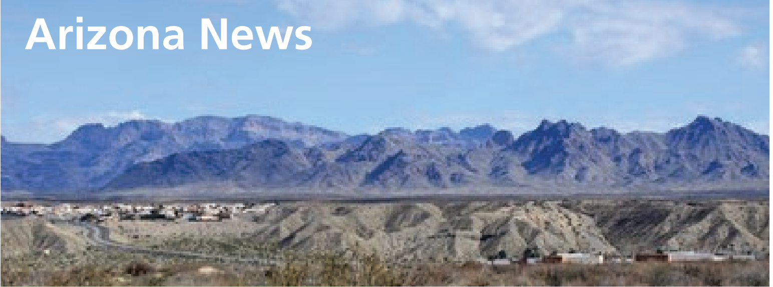
View from the Colorado River Nature Center.