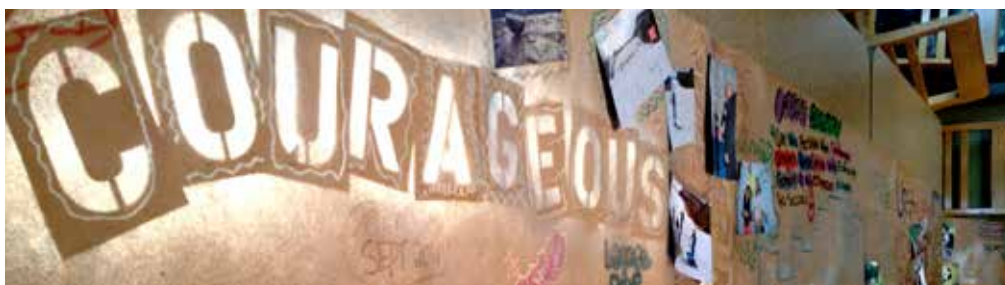
The Urban Blazers at the St. James School creatively document their adventures.

Assist with public involvement to scope alternative trail routes in Pennsylvania; provide project guidance and meeting coordination.