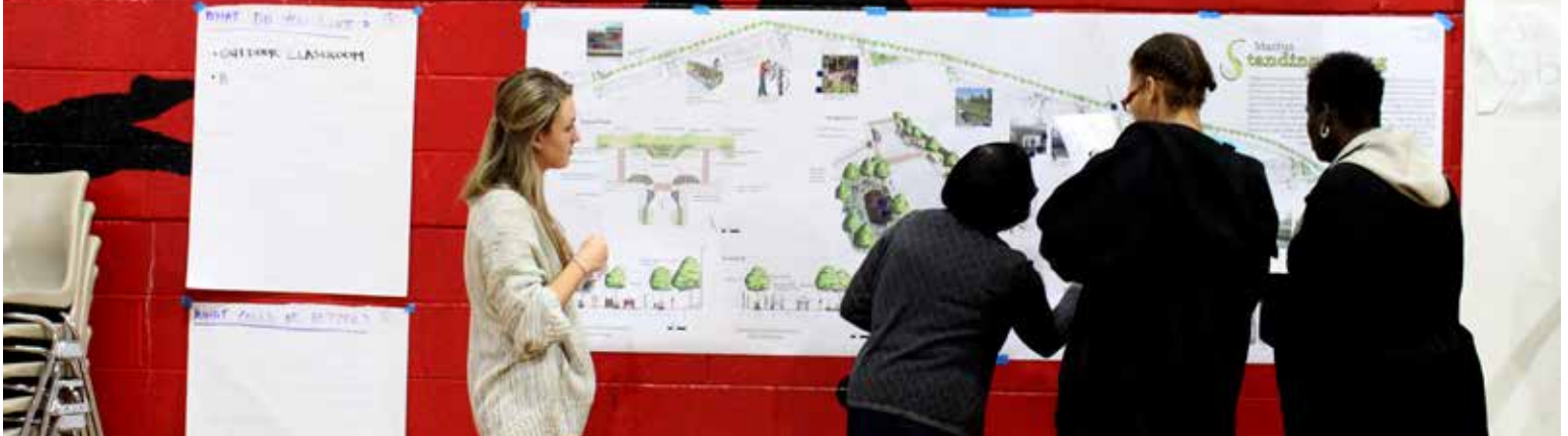
Mantua residents provide Philadelphia University landscape architecture students feedback on their master plans for the Mantua Trail.