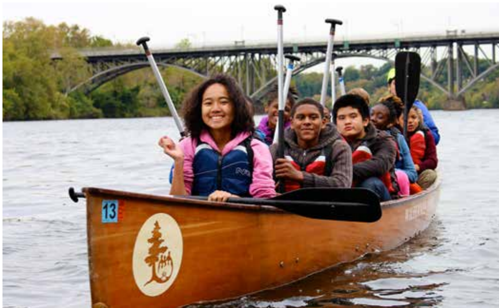
Philadelphia students explore the Schuylkill River in a Wilderness Inquiry Voyageur canoe.