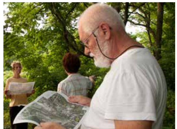
Board members of MACWell-Mercersburg Area Council for Wellness-walked the proposed route of Johnston Run Waterway Trail which is currently in the planning stages.

provide users with a connection to nature, and attract visitors supporting the local economy. The watershed management plan will guide restoration to improve the health of Johnston Run and provide resource information for stream-side environmental education programs. When viewed holistically, these actions serve as a model of stewardship: caring for people through healthy exercise, sense of place, and respite from daily activities; caring for the environment through restoration and sound natural resource management; and caring for downstream neighbors along the Conococheague Creek, the Potomac River, and the Chesapeake Bay.