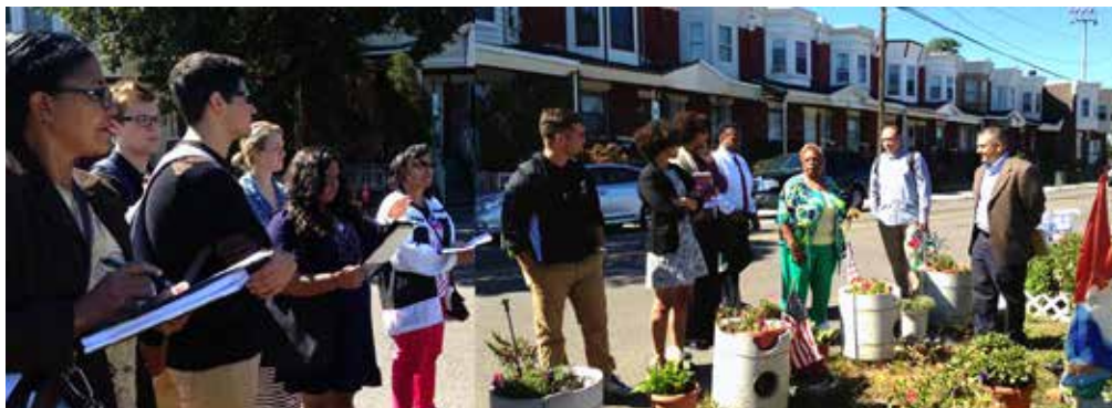
Mantua residents and Philadelphia University students perform a walkability audit of the current trail route.

Develop a 3-mile trail connecting the McDade trail in the Delaware Water Gap National Recreation Area with the Delaware State Forest trail system in Milford; provide educational and recreational experiences for school groups; provide a venue for guided hikes and other community events hosted by partner organizations.