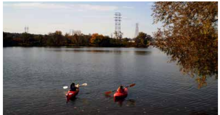
Paddlers enjoy a calm day on the Ohio River Water Trail.

The Ohio River Trail Council is keeping busy these days. In little over one year, they formed a water trail committee, applied for and received designation as a Pennsylvania State Water Trail, and completed a high quality map and guide! These tasks were completed in partnership with the NPS and funded through a Challenge Cost Share program grant of $9,900.