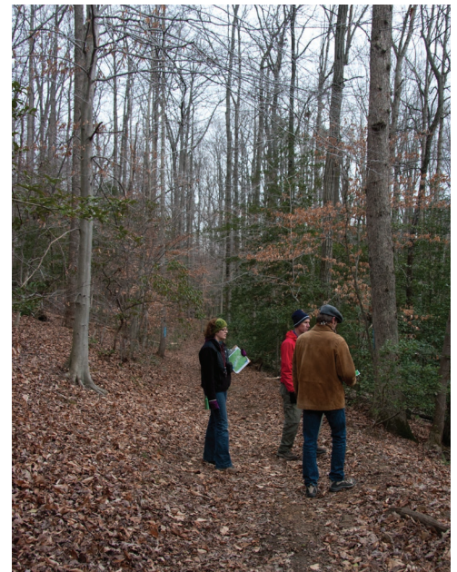
Staff of Scenic Rivers Land Trust, US Fish and Wildlife Service, and Chesapeake Bay Program evaluate potential trail locations.

Guide the process to delineate lands for natural resource value protection, facilitate preparation of a strategic conservation action plan, and leverage financial and technical support.