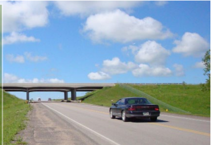
Site of Box Elder Safe Routes to School Project