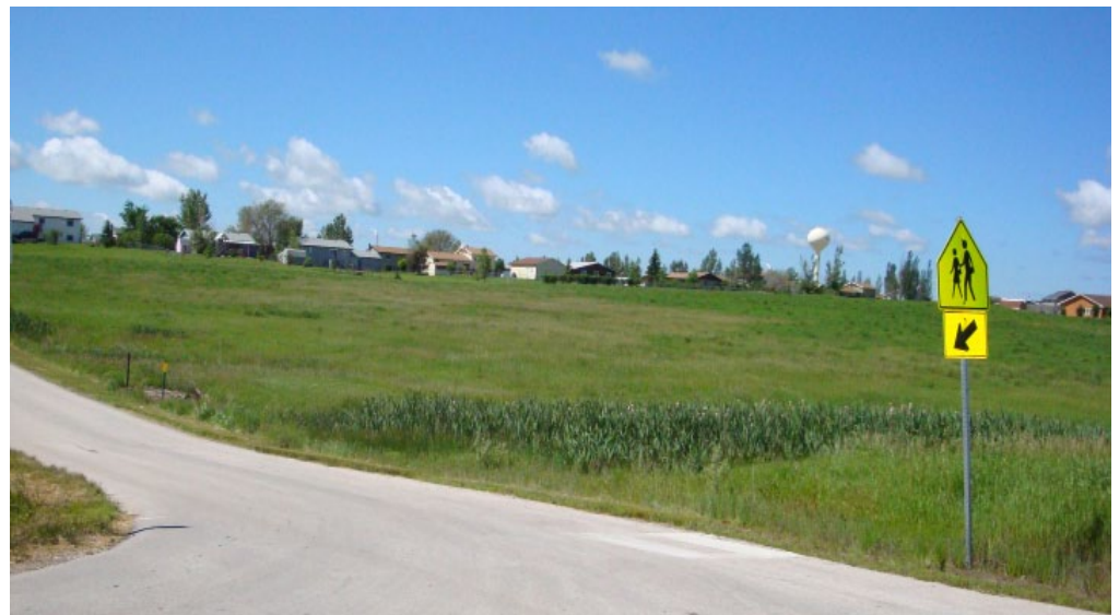
Another opportunity for developing Safe Routes to School