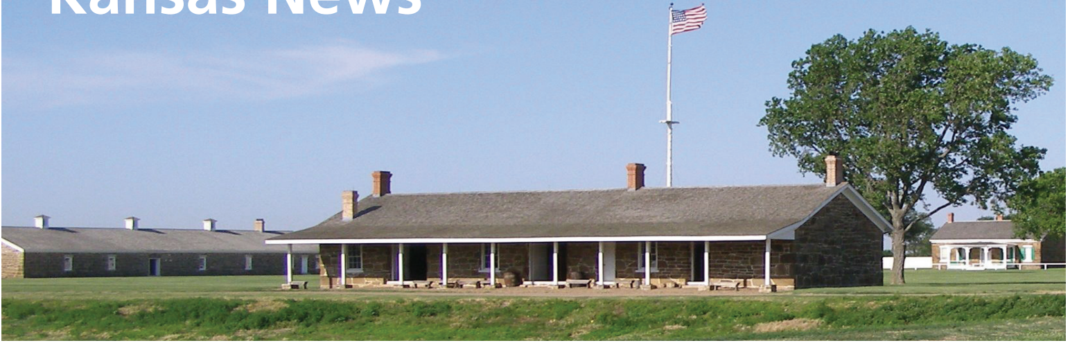
Fort Larned - a destination of the Pawnee Valley Trails Project.