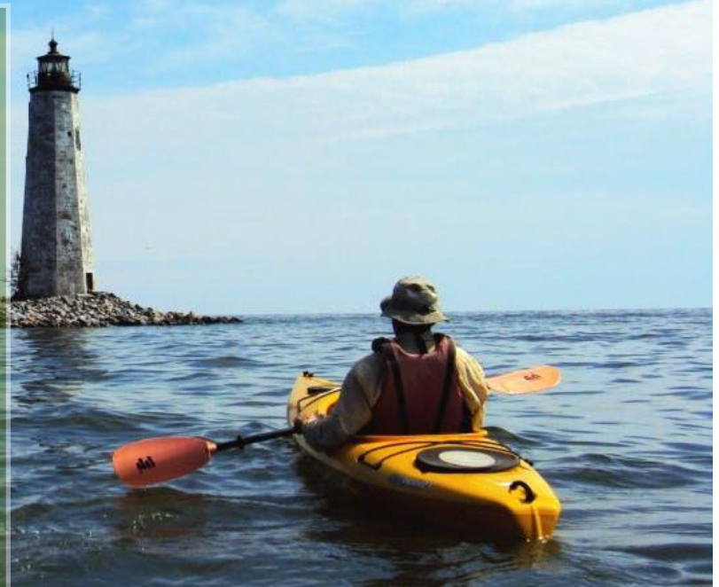
A lighthouse along the Mathews Maritime Heritage Trail