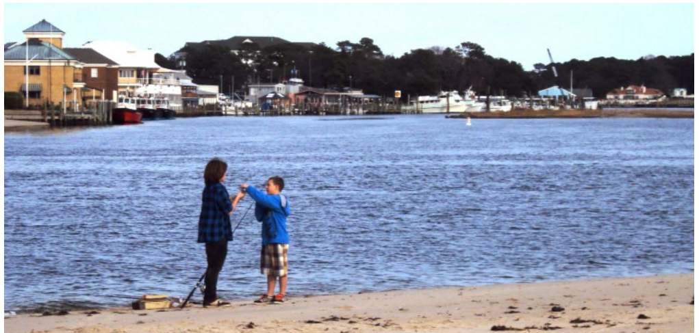
Lynnhaven Beach on the Southeast Coastal Paddle Trail