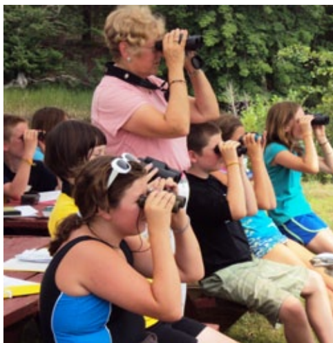
Birding along the Trail

Project Partners: Occoquan Watertrail League (OWL)