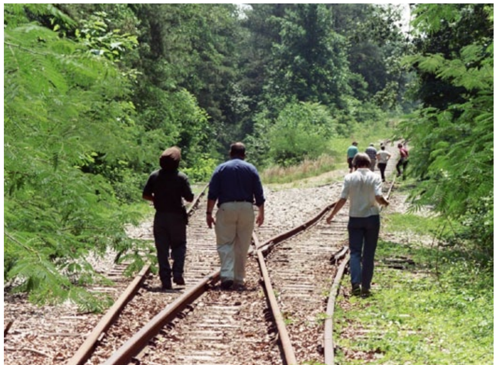
Team assessing the James River Branch Rail Trail

Since completion of the plan in March 2010, the "Friends of the JRB" has been established to assist with partnership development and outreach; and in May 2010, a documentary of the JRB was aired by "Virginia Currents," a local public television program. In June 2010, the Mayor of Richmond established the Richmond Pedestrian, Bicycling and Trails Planning Commission to oversee implementation of the JRB as well as other trail and greenway initiatives.