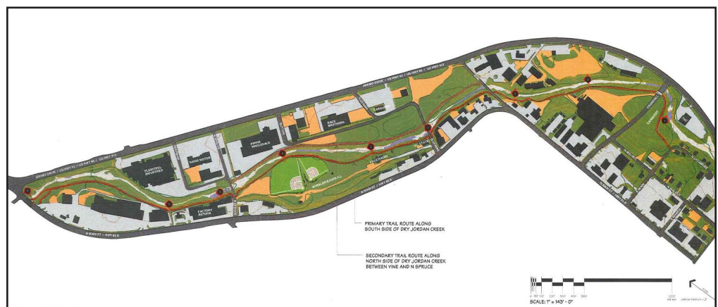
Dry Jordan Pedestrian and Bicycle Trail Plan, Harrison, AR.

RTCA will assist the Mississippi River Connections Collaborative with organizational development, outreach to other organizations and agencies, and development and implementation of their strategic and operations plans. Assistance will also be provided to increase MRT's capacity to help develop water and land based trail along the Mississippi River.