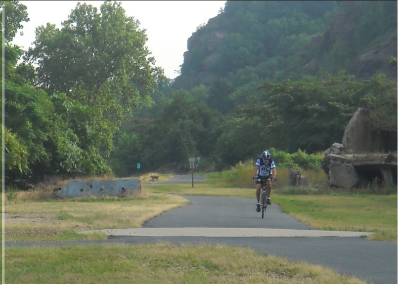
Biking along the Arkansas River Trail.