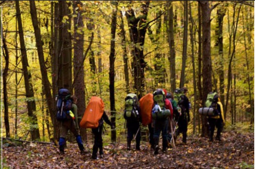
Greening the Crossroads Project, central Indiana, Green Infrastructure and trails!