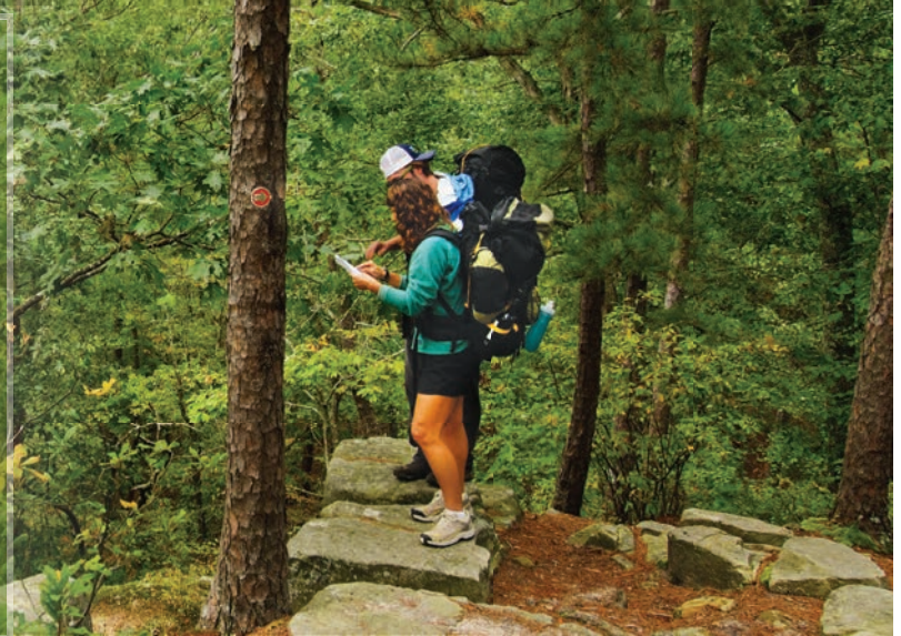
Discovering Missouri's Trails.