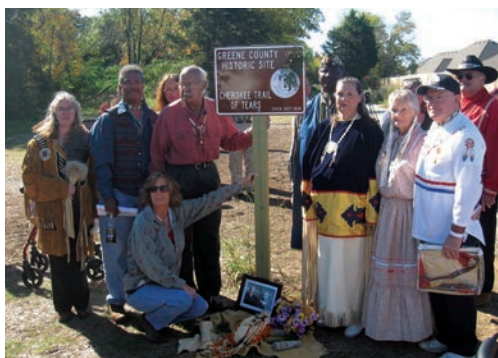
Trail of Tears phase one dedication.

RTCA will work with stakeholder groups on development of historic trail resources in Greene County.