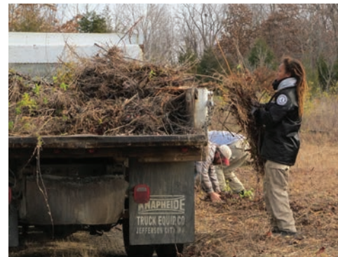
National Civialian Community Corps (NCCC) youth trail crew and City of Eldon Public Works employees clear the way for the Rock Island Line Trail.

Assist with concept planning, community engagement, and funding research for the trail system.