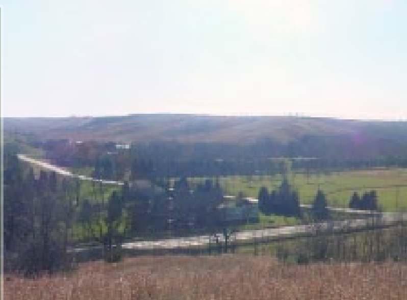
Lincoln County Hole-In-The-Mountain Park from the 2nd highest point in the state.