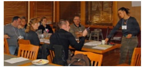
North Shore Scenic Drive Team at International Community Congress (ICC)

Work with local partners and the Minnesota Department of Natural Resources staff to complete a master plan for the Des Moines River Valley State Trail and assist in initiating implementation. Assist in developing an active, sustainable Des Moines River Valley Trail organization.