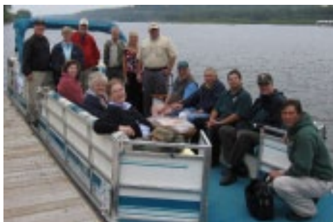
Great Rivers partners on the Mississippi