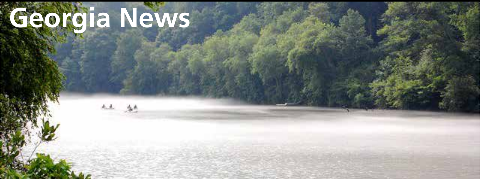
Canoeers enjoy the Chattahoochee River.