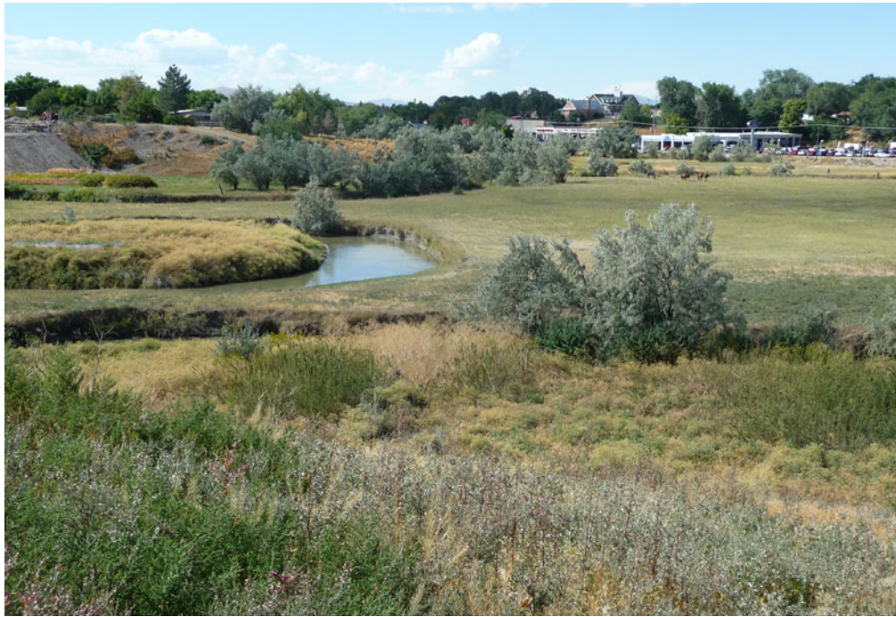
Potential location for a trail along the Malad River in Tremonton City.