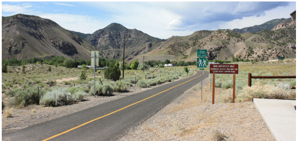
Big Rock Candy Mountain Express, a bike and pedestrian trail.

Assist Salt Lake City and partners with planning and development of a community rail trail including concepts for outdoor education, safe routes for students, community gardens, neighborhood gathering areas, mixed-use, natural areas and recreation opportunities.