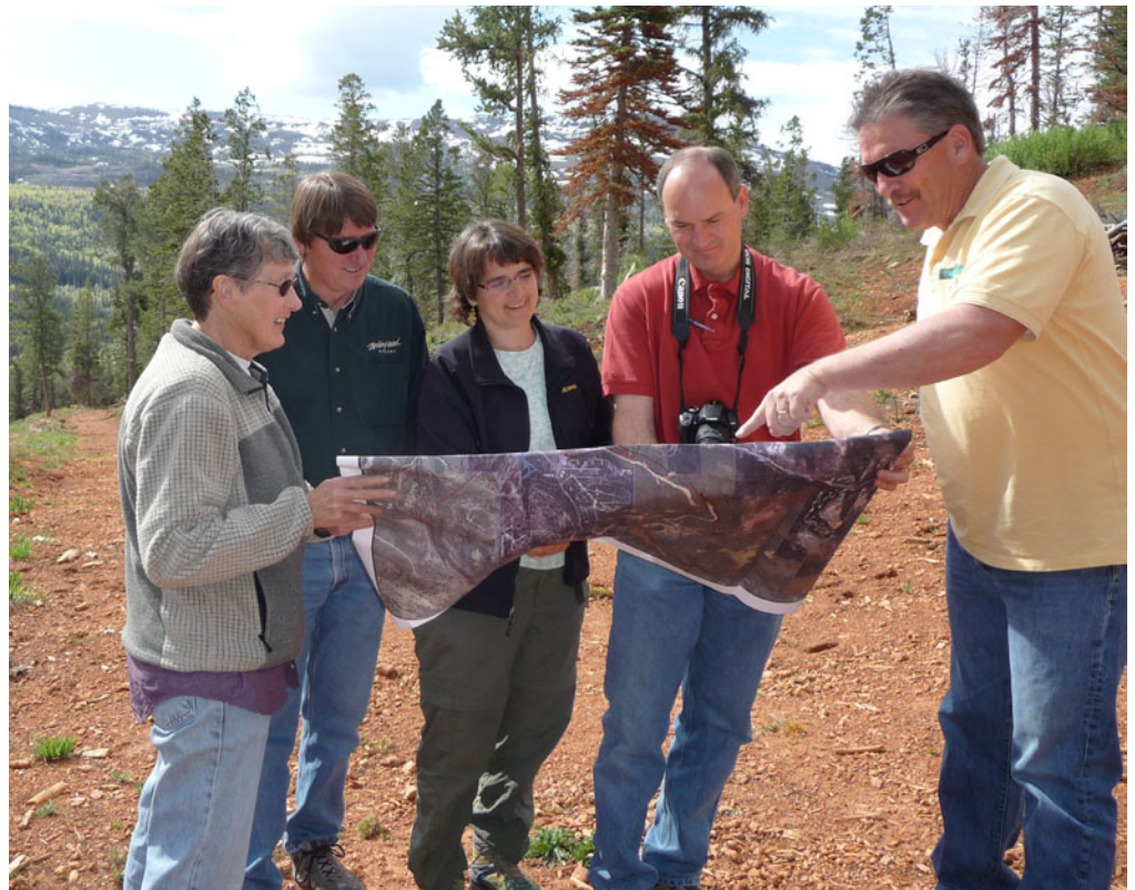
Trailhead planning at Brian Head.

Many of Utah’s small rural communities like Brian Head lack funding and staff to complete comprehensive recreational planning. The RTCA program in Utah provides this along with other natural resource conservation and outdoor recreation services.