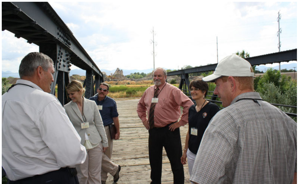
A meeting held on the Jordan River Trail to discuss natural resource conservation and recreation elements to include in the West Jordan Master Plan.

RTCA will work with the Public Transit in Parks - Technical Advisory Committee to assist in providing alternative transportation planning assistance.