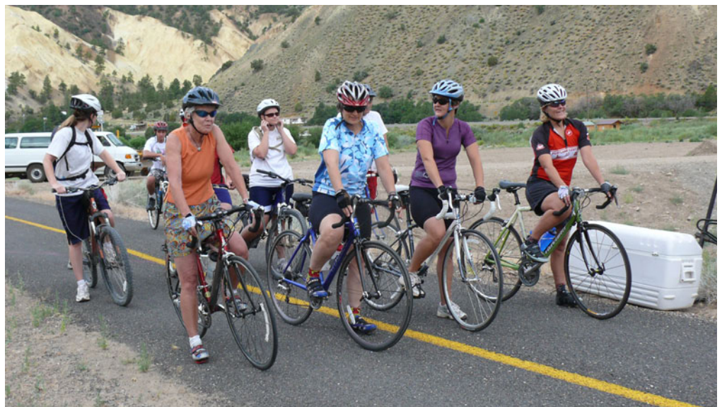
An annual triathlon on the Big Rock Candy Mountain Express Trail attracts bikers, runners, and kayakers and encourages residents and visitors to participate in healthy recreation.

Culmination of a three year planning project for a gateway park and the surrounding 155 acres that will include two miles of trails and three acres of riparian and wildlife restoration.