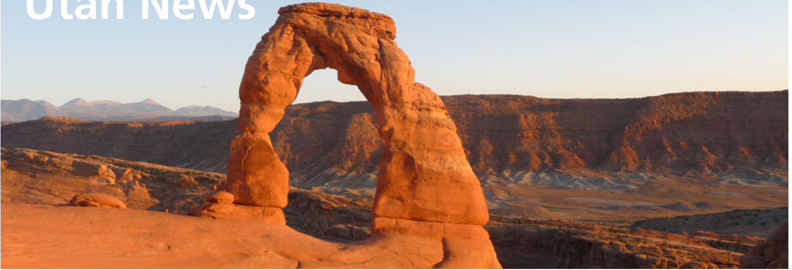
Delicate Arch, Arches National Park