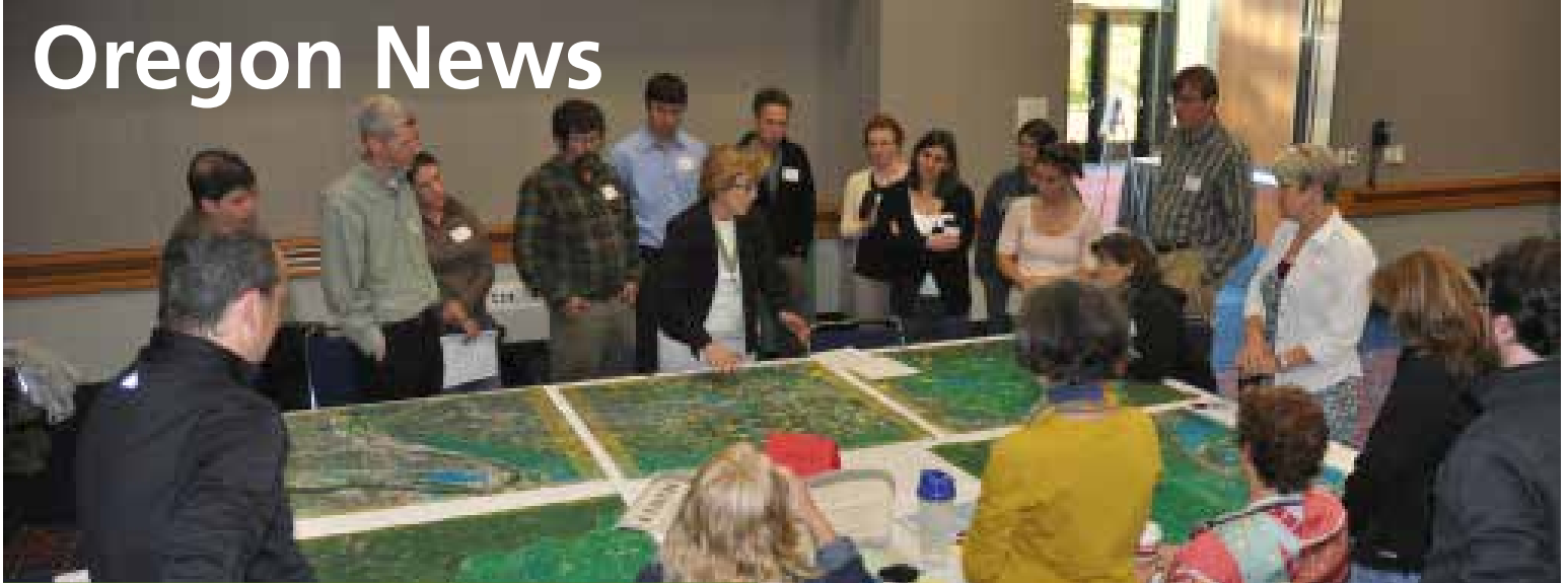
Members of the Intertwine Alliance get together for a Regional Conservation Workshop.