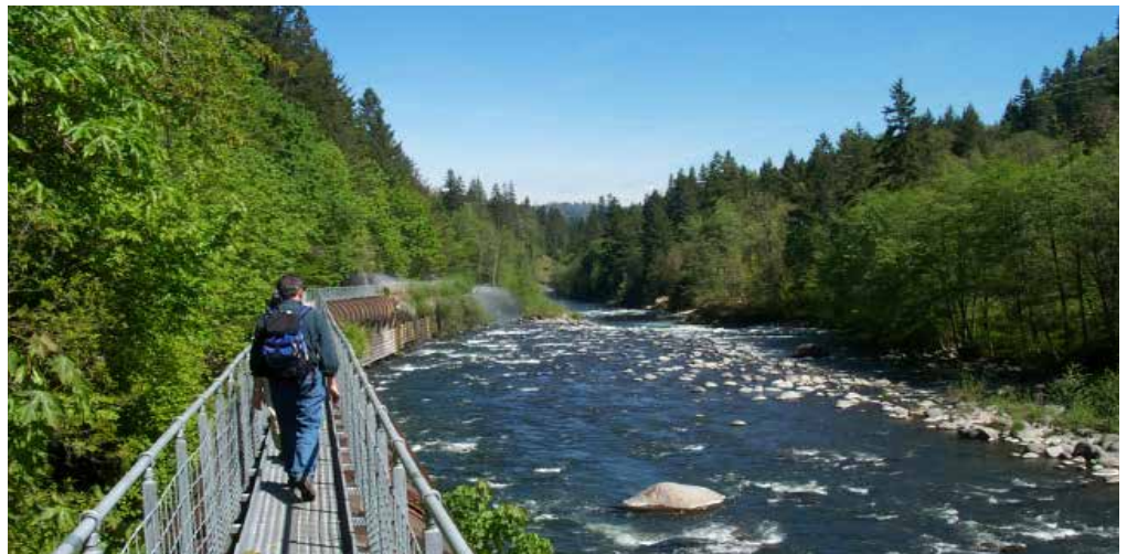
The old Powerdale aqueduct used to provide water to run hydropower turbines and now has the potential to become a unique trail.

Create an alliance of conservation organizations to share existing knowledge, strategies, and approaches for the establishment and management of community forests.