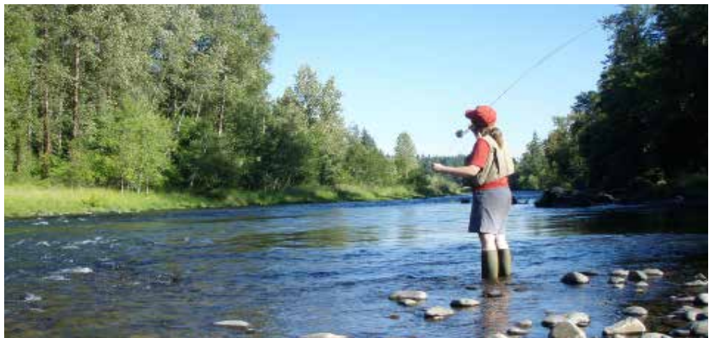
Fly fishing on the South Santiam River.

Help facilitate planning discussions, develop work plans, host collaborative design workshops, provide best practices and case studies for developing a quality, safe bike park.