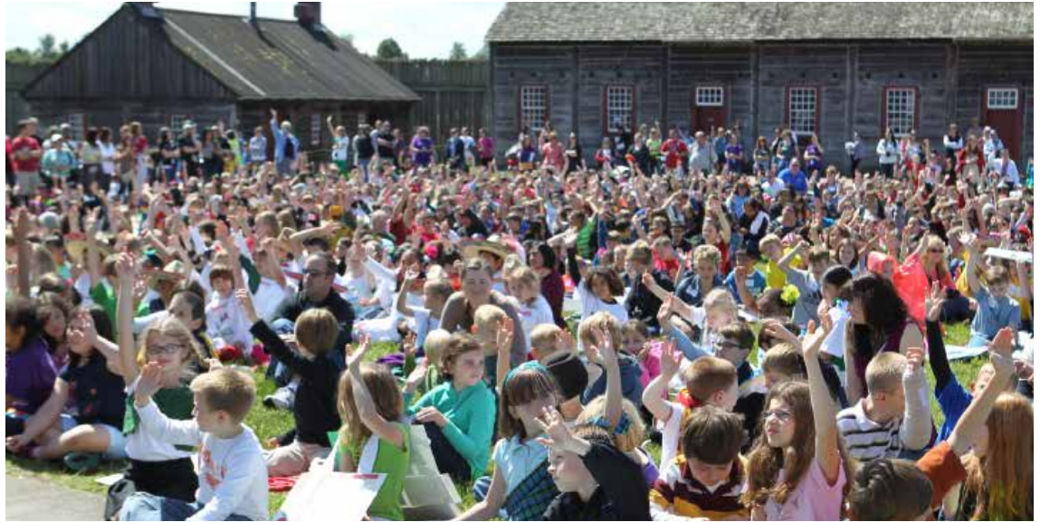
Celebrating the region's rich diversity, third-grade students from all around Vancouver participate in the annual Children's Cultural Parade. The parade takes place at Fort Vancouver, a significant historic site that will be included in the Intertwine Sense of Place project.