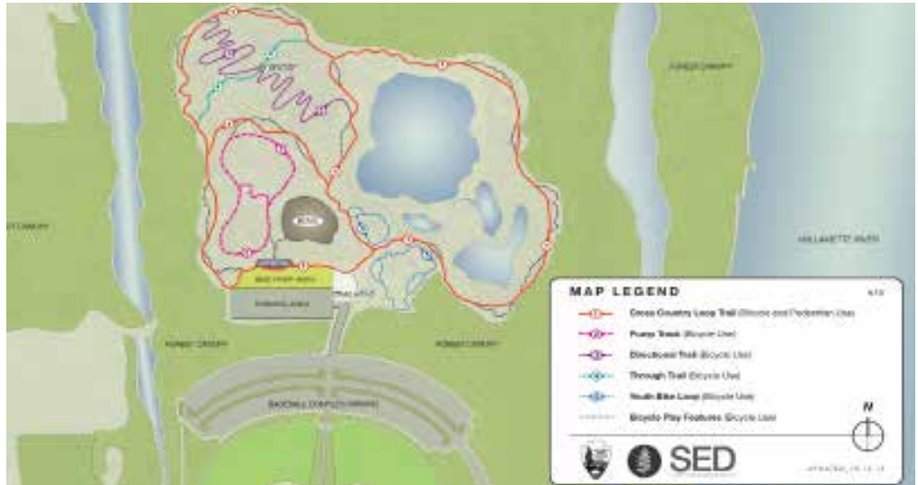
The concept design for the Wallace Bike Park evolved directly from the community design workshop that the NPS helped facilitate. Map: Sector Environmental Design