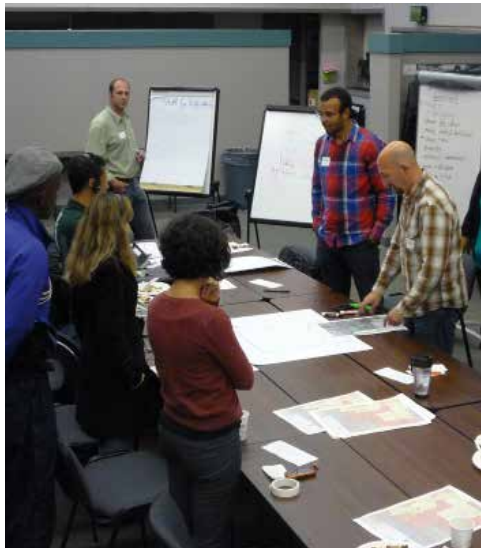
The NPS is helping Groundwork Portland identify potential parks and open space in underserved communities in East Portland.