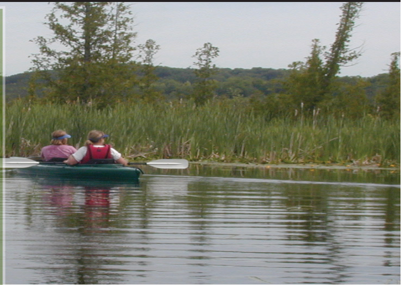
Enjoying the beauty of Michigan's waterways.