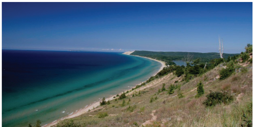
Sleeping Bear Dunes

The Sleeping Bear Heritage Trail is a partnership project coordinated by the Northwest Michigan Council of Governments and supported by the Michigan Department of Transportation, TART Trails Inc., Sleeping Bear Dunes National Lakeshore, Friends of Sleeping Bear Dunes, local businesses, municipalities and RTCA. Funding for design, engineering and construction of the trail comes from a variety of sources, including the Federal Scenic Byways Program, Michigan Department of Transportation, foundations, and a private sector fundraising campaign. Construction for the first section is slated for 2011, which is located in the Lakeshore's most visited area, giving park visitors the opportunity to get out of their cars and either walk, ride their bike, or stroll in a wheelchair along a safe and scenic trail to experience and enjoy several of the Lakeshore's key features and destinations. The Sleeping Bear Heritage Trail will be Michigan's premier trailway experience!