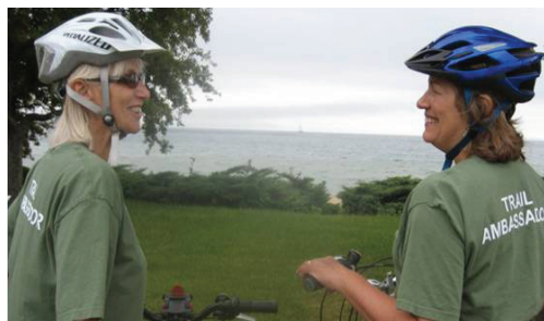
Trail Ambassadors taking a break

Develop a 2-mile water trail through the 300-acre Galien Great Lakes Marsh in New Buffalo, MI, with potential linkage on Lake Michigan to new water trail in northwest Indiana. Increased visibility, use, and community stewardship of the marsh.