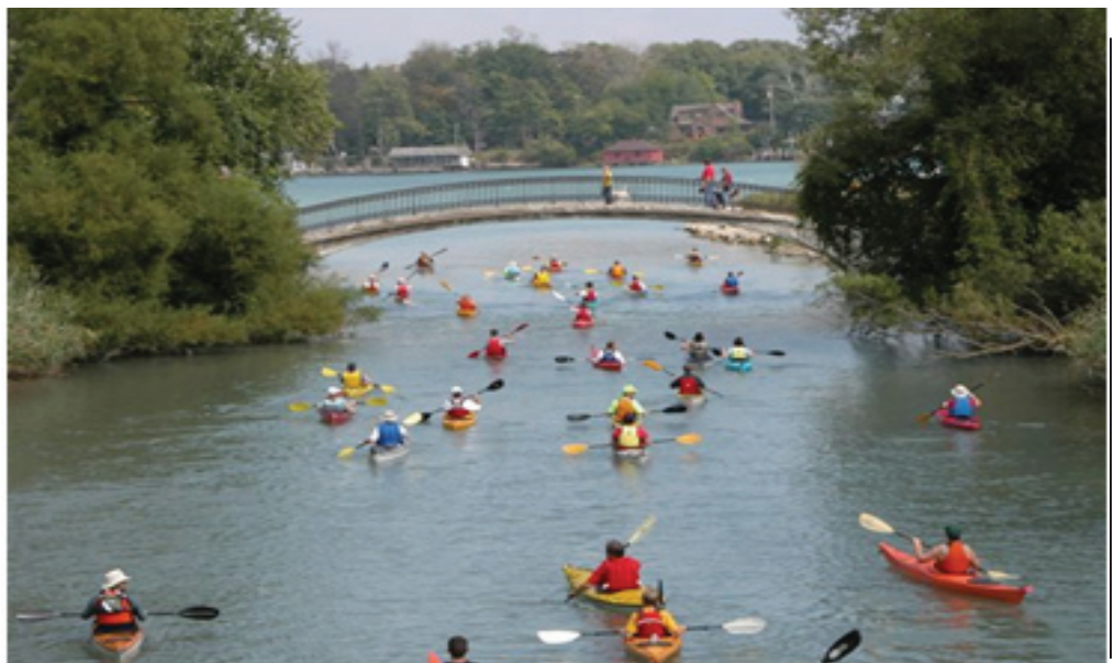
Kayaking the Detroit River

Work with multi-state group to find appropriate bike route through Illinois, both on road and off.