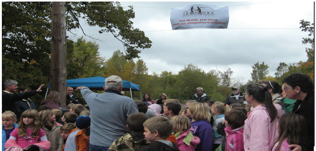
Iron Ore Heritage Trail

To help the Cass River Greenway Committee define the scale and scope of Cass River project and develop conservation & recreation goals, identify actions and an action plan.