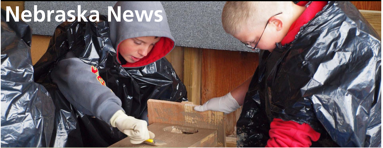
Scouts help at Wildlands Stewardship Day in Scotts Bluff National Monument.