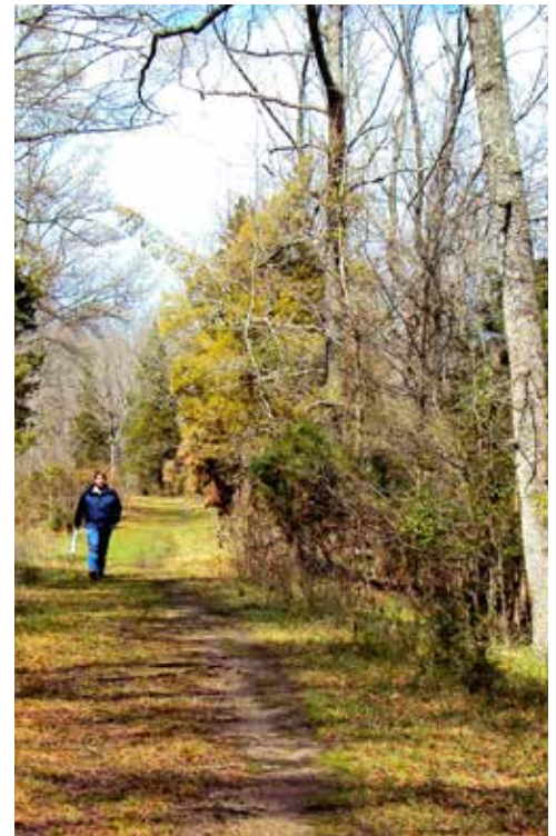
Trails in Spotsylvania County support active recreation, connect people to nature, and provide a venue for learning about local history.

Assist with establishing organizational structure, articulating conservation objectives and criteria, and building collaborative partnerships.