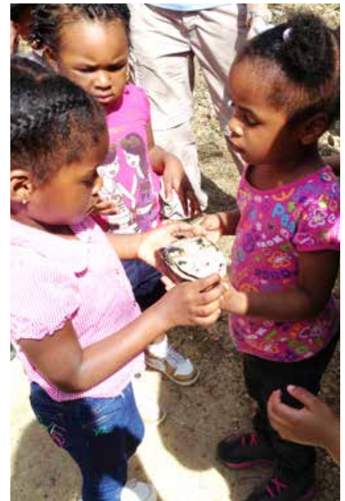
Pre-school youth examine turtle shell during nature walk at Petersburg National Battlefield.

Assist with greenway and blueway planning, flood mitigation, site assessment, and capacity building to address management issues and foster long-term watershed stewardship.