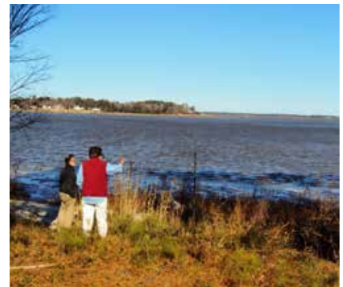
Suffolk Water Trail team members evaluate new canoe and kayak launch site opportunities on the Nansemond River.

Located in tidewater Virginia near the mouth of the James River, Suffolk boasts a proud history and long-standing ties to its rivers. The remnants of bustling commercial wharfs can be seen along its shoreline and even today, watermen ply the waters of the Nansemond River and Chuckatuck Creek searching for the day's catch. Evidence of Native Indian villages, Civil War batteries, historic plantations, and artifacts from days past offer the opportunity to learn about the area's colorful past.