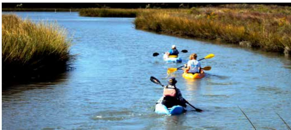
Exploring Suffolk's waterways.