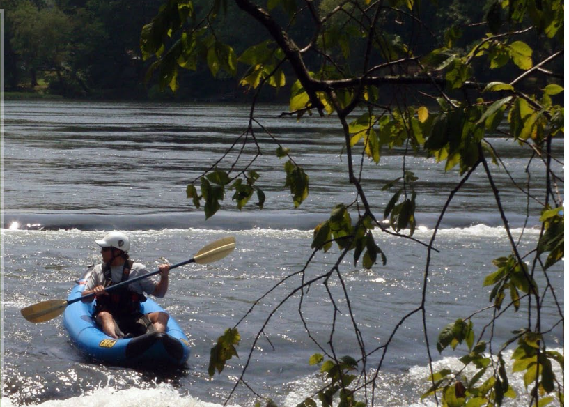
Groundwork Wyoming County Green Team members are led by an NPS Ranger on the New River Gorge National River.