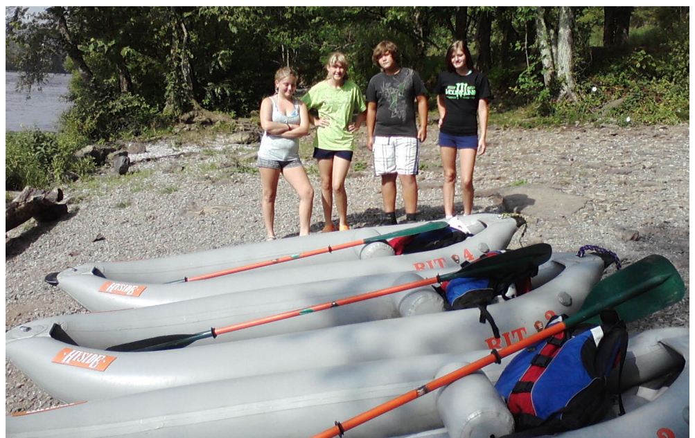
Groundwork Wyoming County Green Team prepares to paddle the New River.