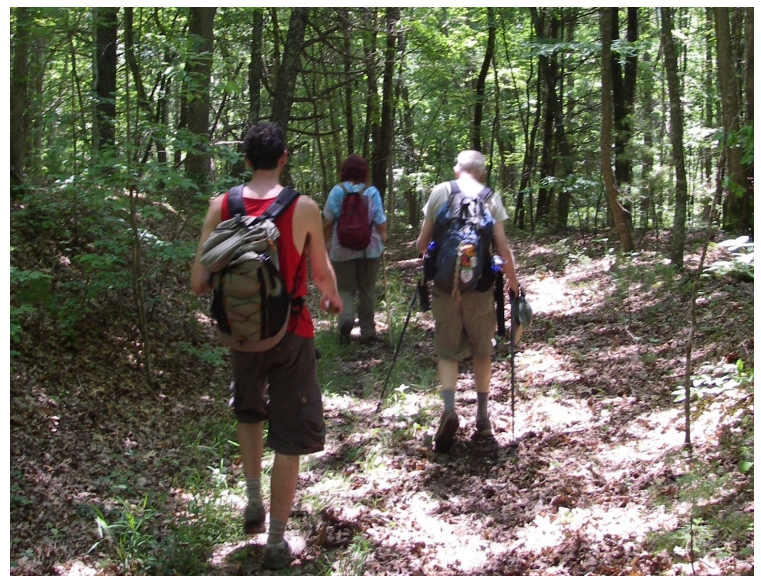
Hiking team scopes the future route of the Great Eastern Trail near Pipestem State Park