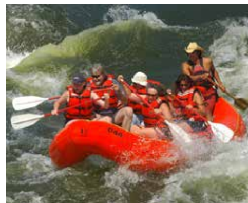
The Payette River Water Trail includes this whitewater reach on the South Fork between Banks and Garden Valley.

Work with project partners to form a coalition and action plan for managing the trail.