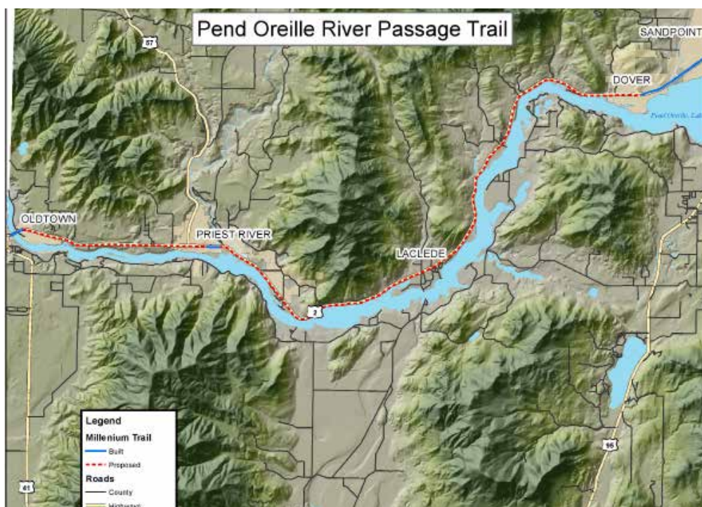
Map of the proposed Pend Oreille River Passage Trail from Oldtown to Dover. Map: David Yarnell, Bonner County GIS Department