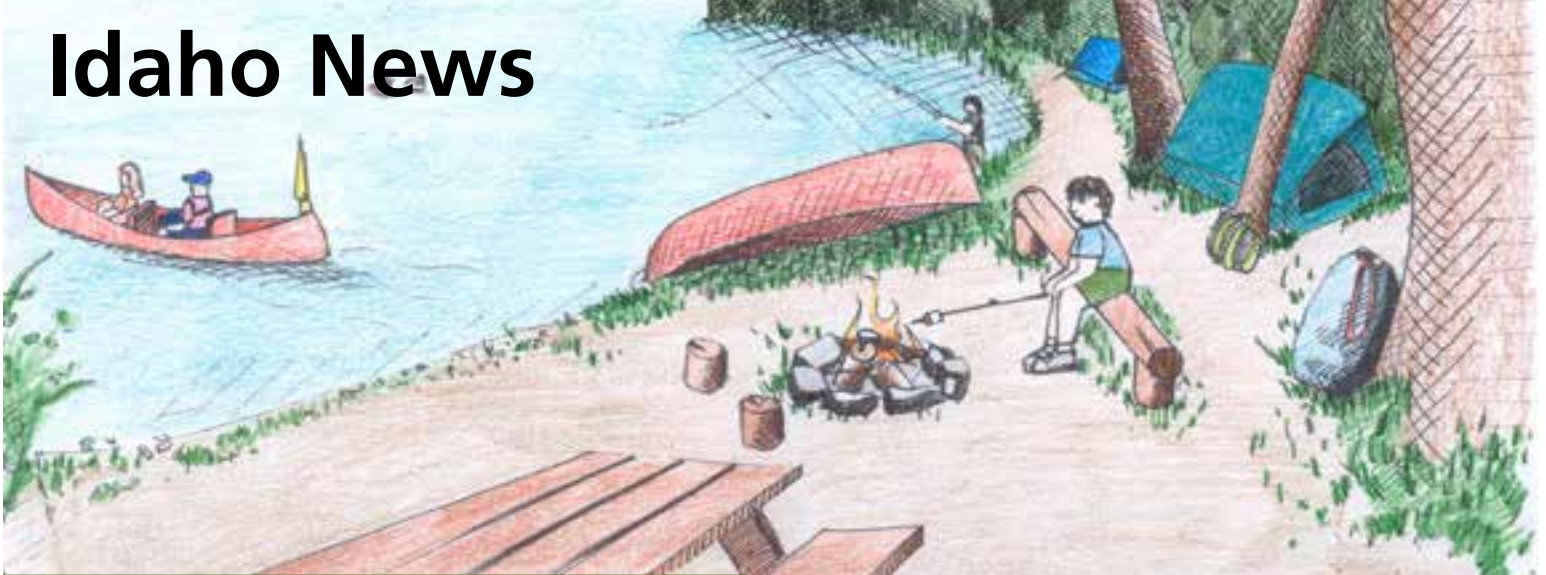
Artist rendering of a water trail campsite along the Lower Clark Fork Water Trail. Sketch: Justin Phillups and Aaron Crowder