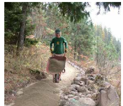
Trail crews built a loop trail with spur trails that lead to the water for fishing access.

The new 'Clark Fork Access Site,' located along State Highway 200, about two miles downstream of the dam, is the trailhead and launch site for both trails. The 2.5-mile land trail is a loop that includes five spur trails to the river for fishing access. The water trail extends downstream to Lake Pend Oreille and continues along the north shore of the lake, providing more than 40 miles of water-based recreation opportunities. Eight more access points for the water trail have been developed in partnership with Bonner County, Idaho State Parks, the U.S. Forest Service, Idaho Fish and Game, and the Army Corps of Engineers.