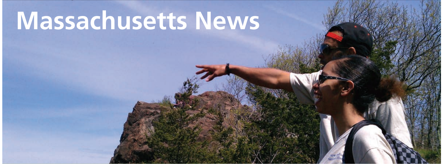
Summer Hikers on the New England Trail.