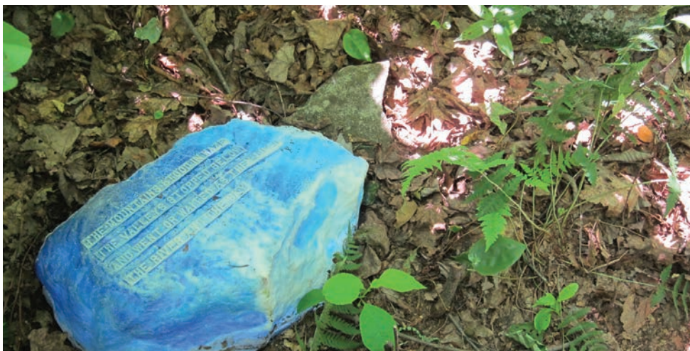
Hespera Stones: Art on the New England Trail.

Share successful strategies for working with private landowners, engaging public support, and identifying funds.