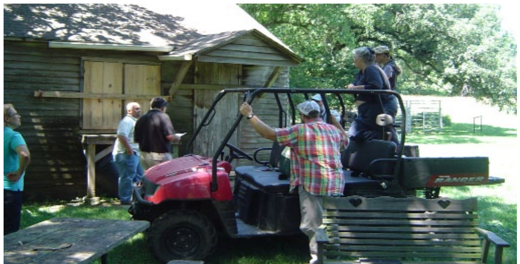
Whiterock Property Tour and Trail Study

To assist with formalizing a basic visitor infrastructure plan which will help refine trails plans and improve the trail concept map. Provide design concept plans for an outdoor learning with nature classroom. Assist in identifying potential funding sources, assist in ground-truthing the concept design plan and final trail plans, and provide technical expertise in multi-use sustainable design. Also, after construction is complete, assist in developing a monitoring and research program, conduct feasibility studies, and develop plans for additional visitor amenities.