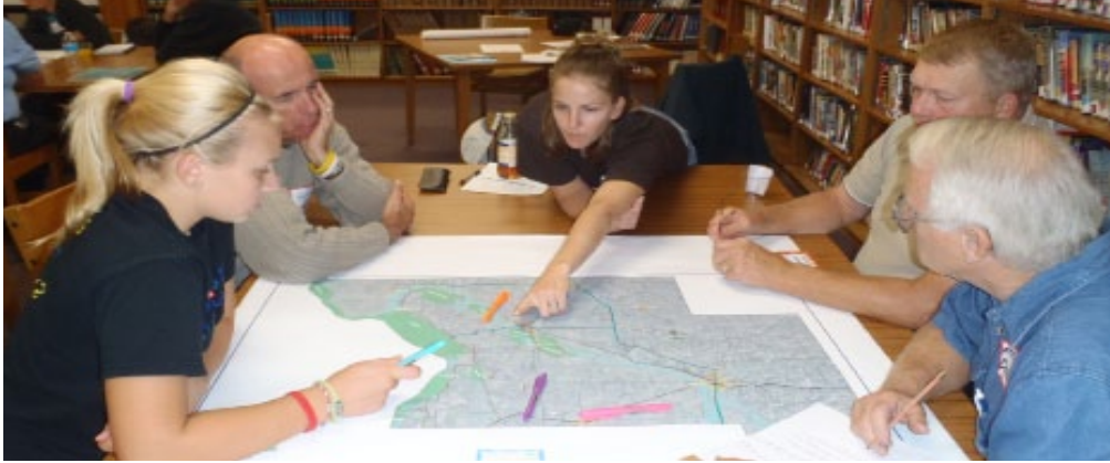
Louisa County Trail Master Plan Listening Session