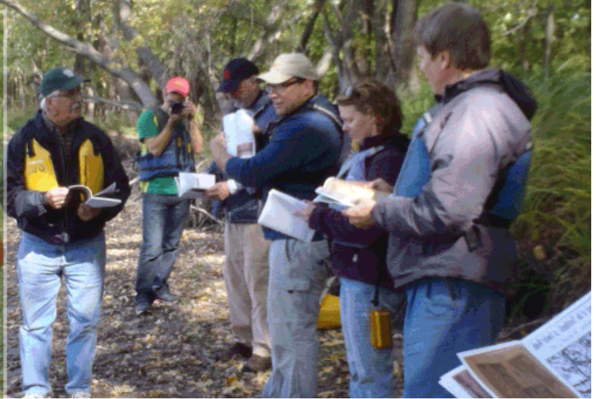
Central Iowa Greenway River Tour