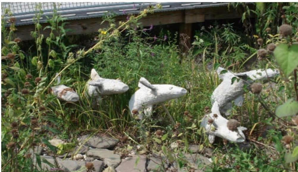
Art along the trail in Cincinnati

Project Partner: Mill Creek Restoration Project