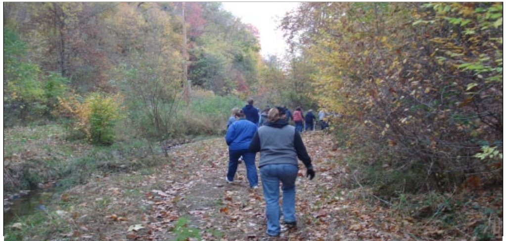
Wadsworth future trail site

RTCA Contact: Andrea Irland Location: Cincinnati Congressional District(s): OH-1