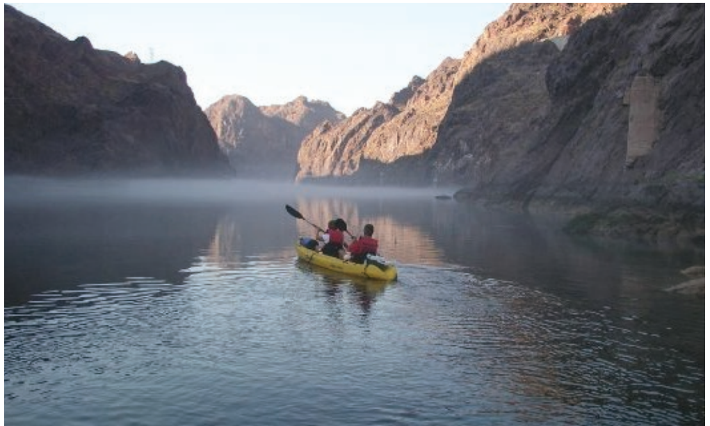
Kayakers enjoy scenic views along the Black Canyon Water Trail.

Facilitate the development of a shared vision and conceptual plan for Beaumont Park through community engagement and a design charrette. Build partnerships between the City of Reno, Washoe County, Friends of Beaumont Park, Truckee Meadows Trails Association, Nevada