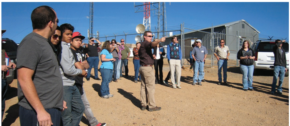
The Red Hill Design Workshop began with a site visit and presentations by botanists, landscape architects, trail designers, and staff.