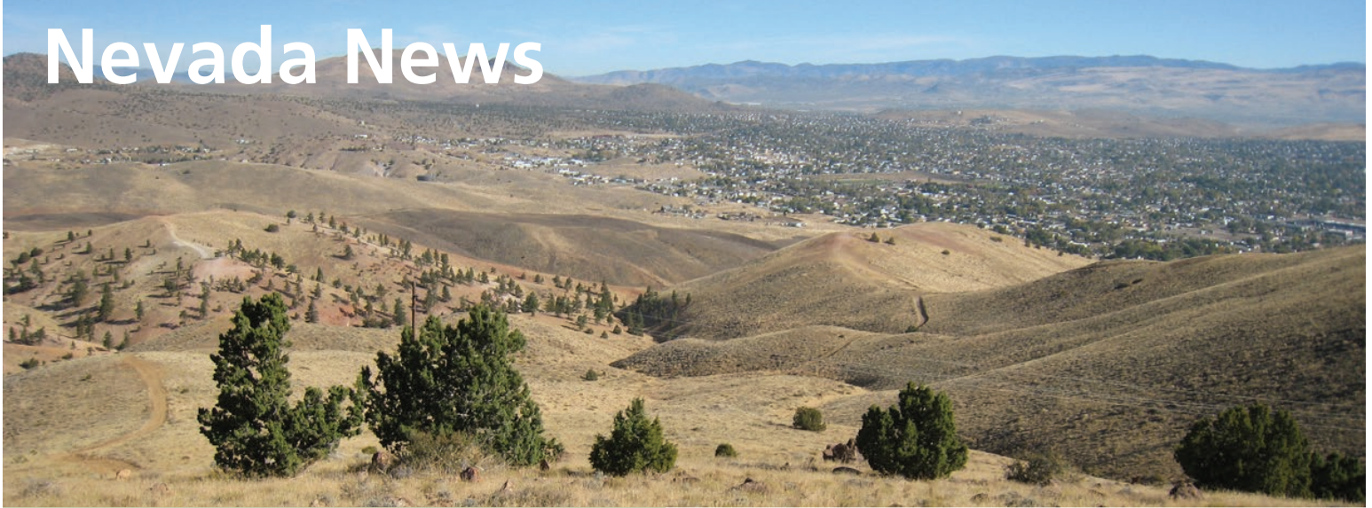
Red Hill will provide close-to-home recreation for residents of Sun Valley and Reno.