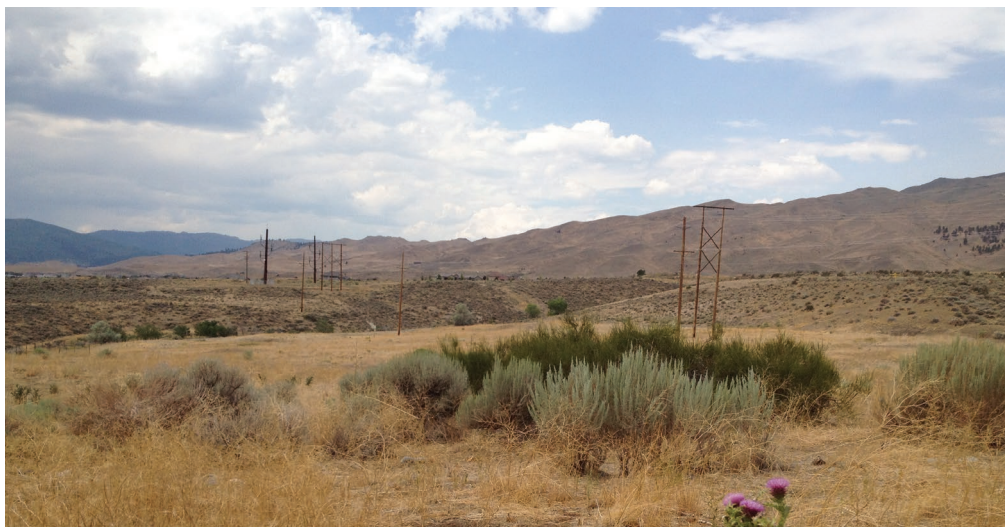
A closed golf course in Reno is envisioned to become Beaumont Park.

Facilitate agreement on content for the Black Canyon Water Trail guide and map in collaboration with project partners. Facilitate the development of a partnership for the greater Colorado River Water Trail in Nevada.