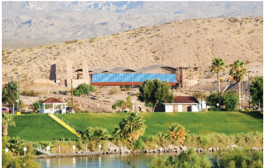
The first phase of the Colorado River Heritage Greenway Trails system, featured in the America's Great Outdoors report, included 9 miles of trails, a signature bridge, and a new park.

RTCA will facilitate two workshops of the Laughlin Colorado River Heritage Greenway Trails Partnership in order to reconfirm the group's vision and goals, clarify roles and develop a work plan