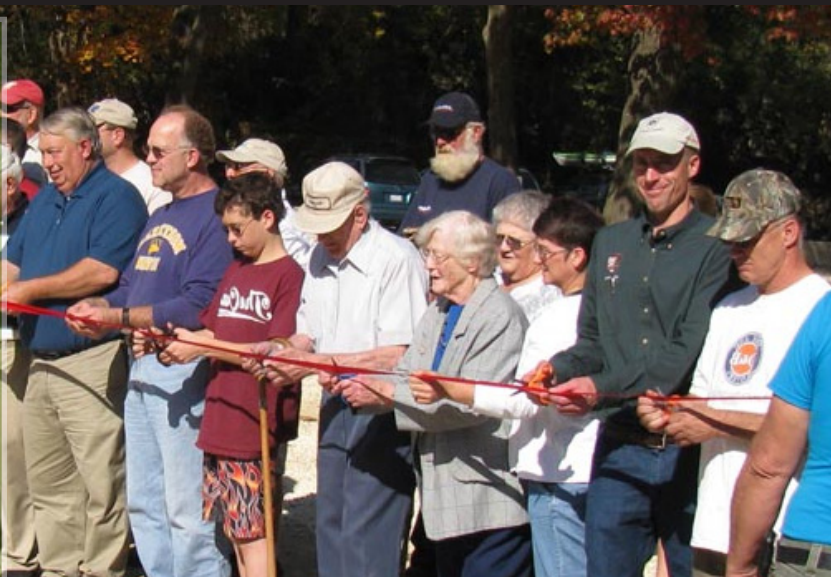
Maquoketa Water Trail Dedication.