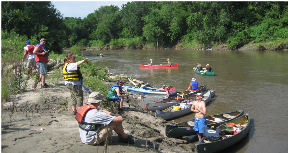
Project Aware River Clean-up.

Locally: Develop 71 miles of trail from Vicksburg, MS to Natchez, MS. Nationally: Create a network of 3,000 miles of trail from Minnesota to Louisiana.