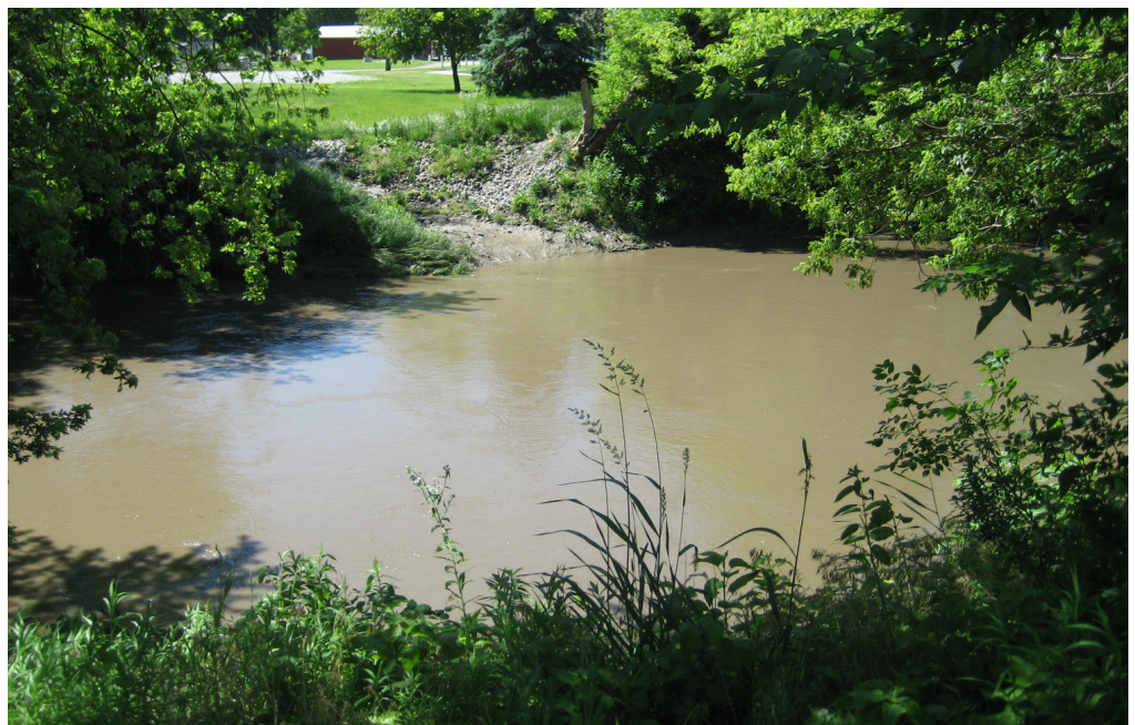
City of Avoca - site of trail access to Edgington Park.

Provide assistance to the Board of Trustees in the planning and development of nearly 30 miles of multi-purpose soft trail within the more than 5,000 acres of scenic Whiterock Conservancy lands