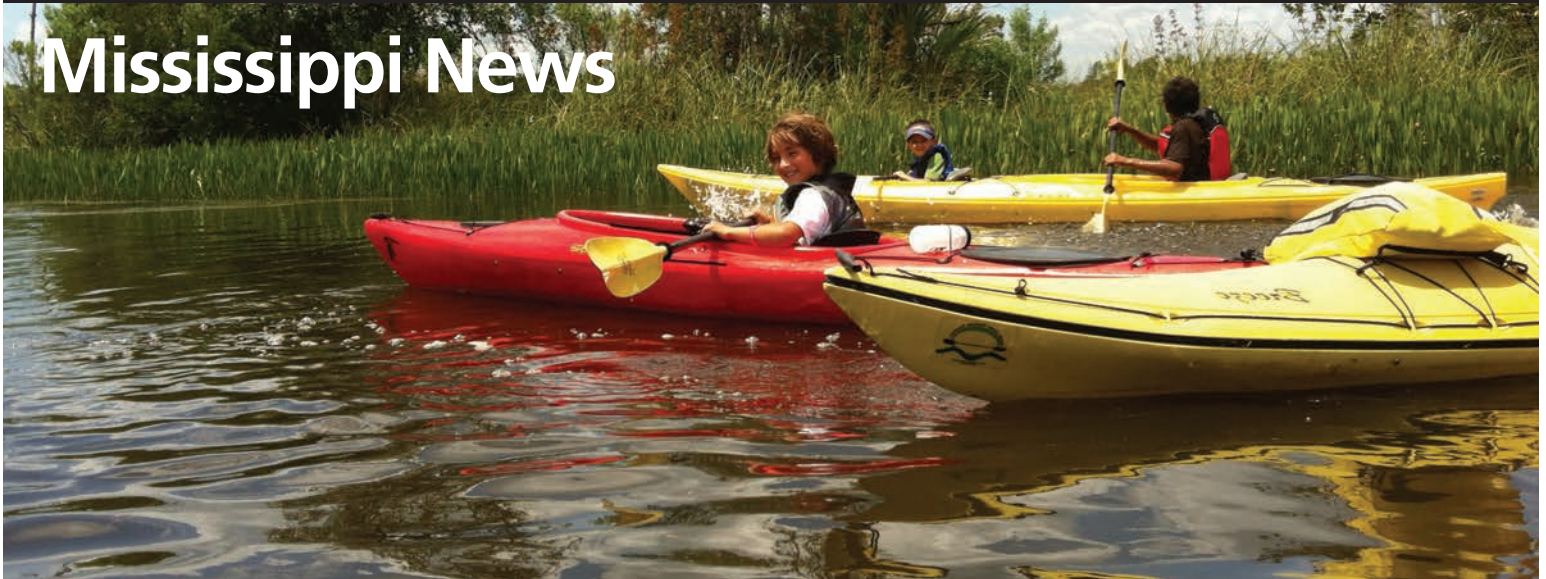
Canoers enjoying the Pascagoula River.