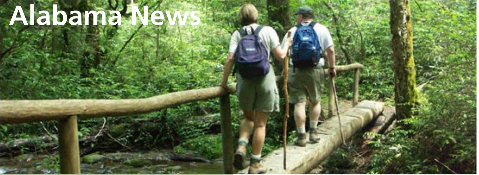
Hiking in North Alabama