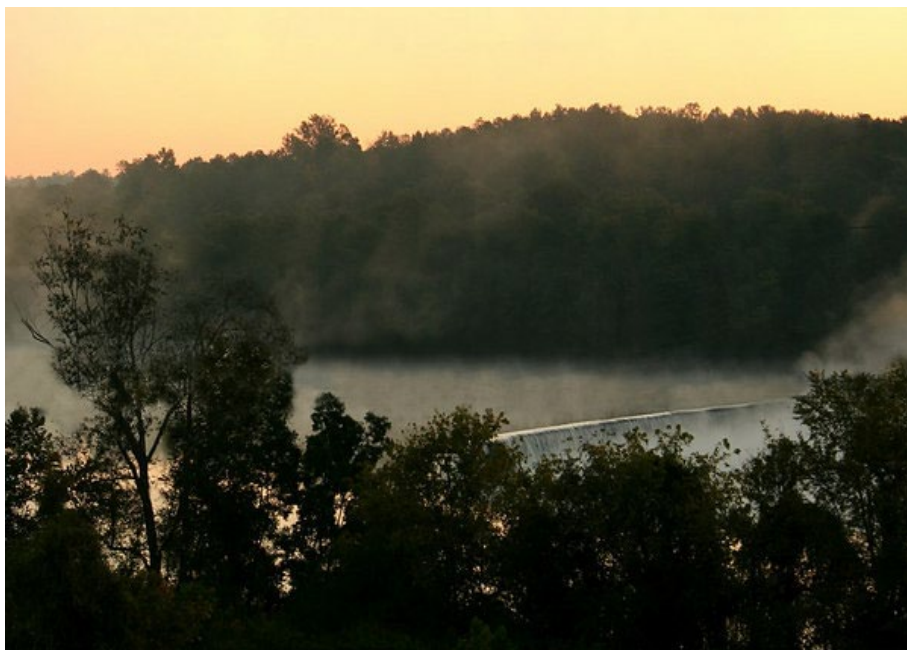
A view of Langdon Dam along the Chattahoochee River. This Dam will feature prominently in the revitalization of the Valley Riverwalk that will be incorporated into the master plan.

RTCA will assist in the planning aspect of the blueway, provide technical assistance in design standards and mapping, and facilitate meetings with partners and local communities.