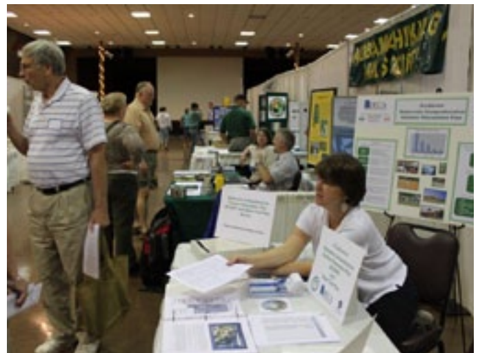
Participants at the Alabama Statewide Trails Conference trader expo.