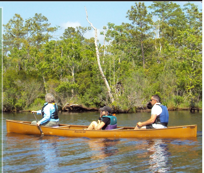
Canoers on the West Neck Creek