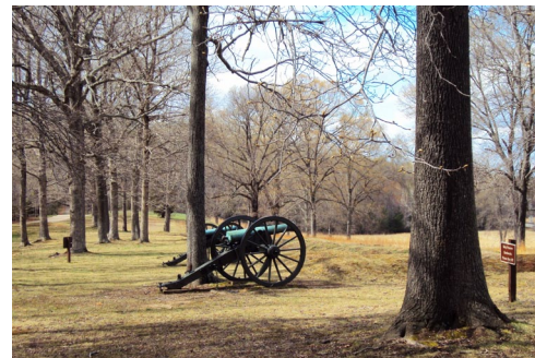
Fredericksburg and Spotsylvania National Military Park

wellness opportunities, and inspire respect and responsible stewardship of green space resources.