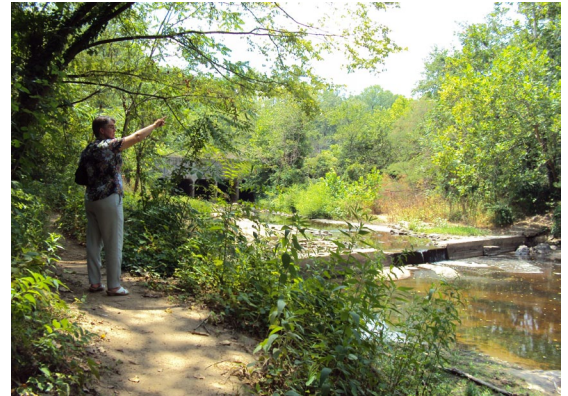
The James River Heritage Trail alongside Reedy Creek.

The James River Heritage Trail (JRHT) is a proposed braided network of land and water trails extending over 300 miles from the headwaters of the James to the Chesapeake Bay. Winding its way through Virginia's heartland, the geographically diverse river corridor offers a world-class recreational experience. The JRHT also provides an opportunity to learn about the area's rich history -- from the origins of colonial settlement in Jamestown, to the Cumberland Gap where Virginians crossed the Cumberland Plateau barrier to settle Kentucky. For the nature-lover, visitors to the trail will find important birding areas, eagle populations, and miles of wetland habitat and shoreline to explore.