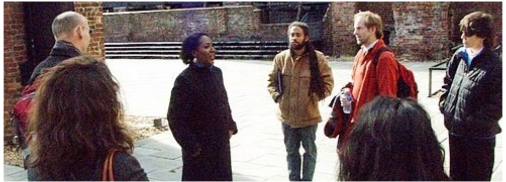
Site visit by Groundwork Trust evaluation team, February 2010