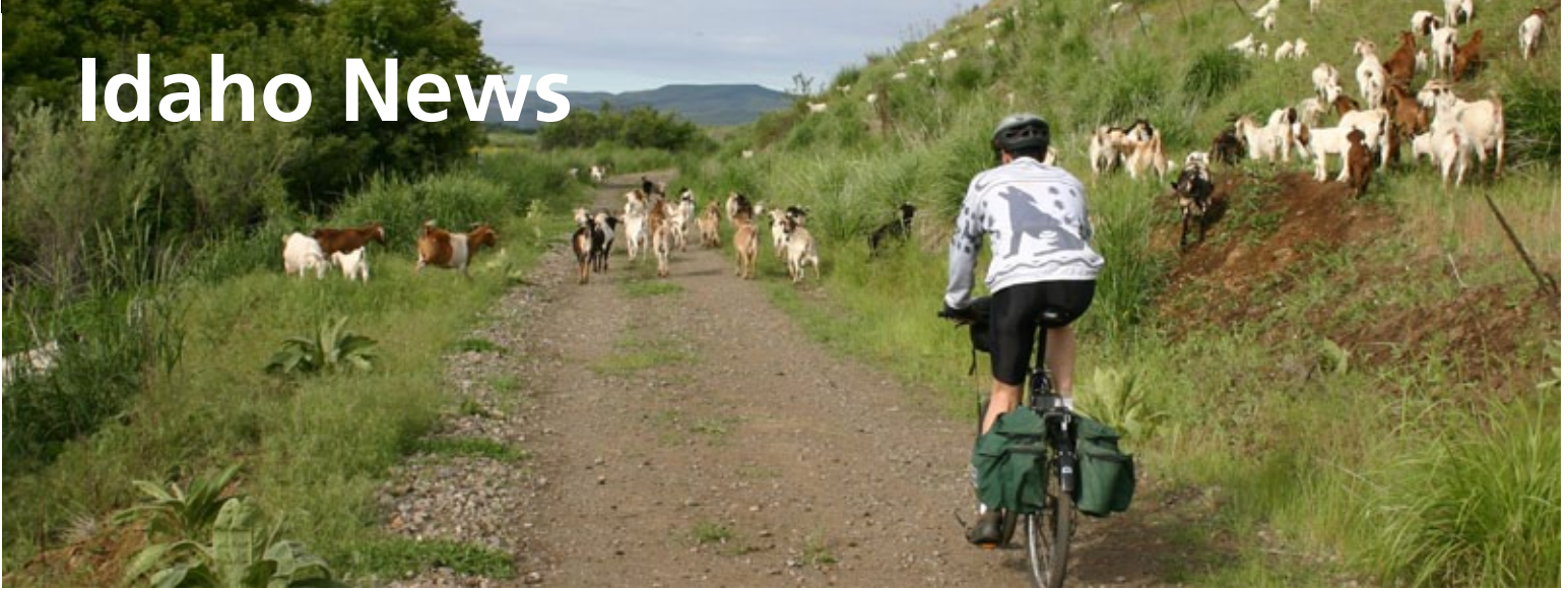
The 85-mile Weiser River Trail, recently designated a National Recreation Trail, connects communities between Weiser and New Meadows.