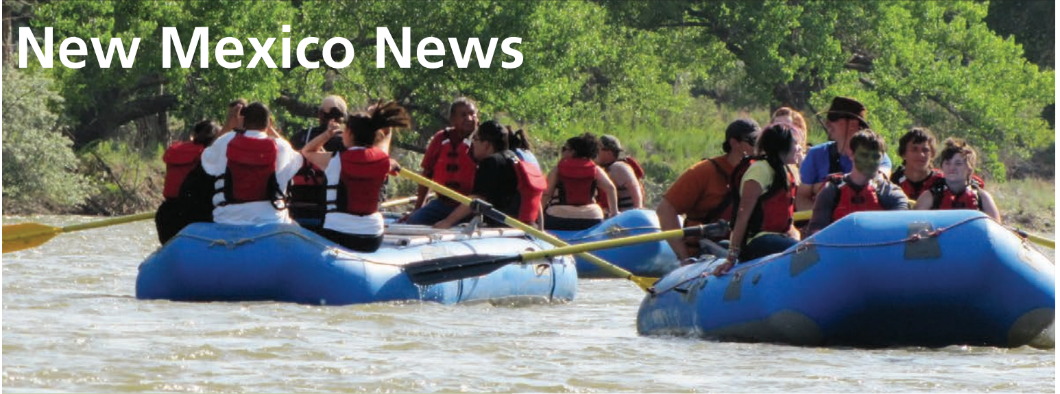
Rafting on the Animas River.