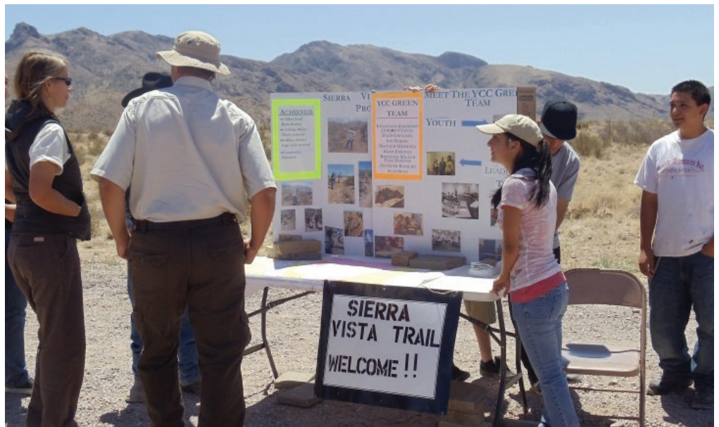
Sign-in and information table for Sierra Vista Trail project.

Provided assistance in partnership building with BLM, content review for interpretive/education materials development, and organizational development support of the GWDA staff and Board of Directors.