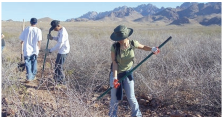
GWDA Green Team members on the Sierra Vista Trail.

On the Sierra Vista Trail project, 12 Groundwork Doña Ana Green Team members restored and maintained existing trails and built new trails that provide outdoor recreation opportunity and protect the mountain system's natural resources. A sensitive barrel cactus habitat area was protected by diverting the trail and preventing further erosion on the trail. Interpretive signage and information about the trail, recreation etiquette, and environmental education were installed at key segments of the trail. Green Team members learned about erosion issues, endangered species protection, invasive plants and trail maintenance and building through this project and their community outreach events.