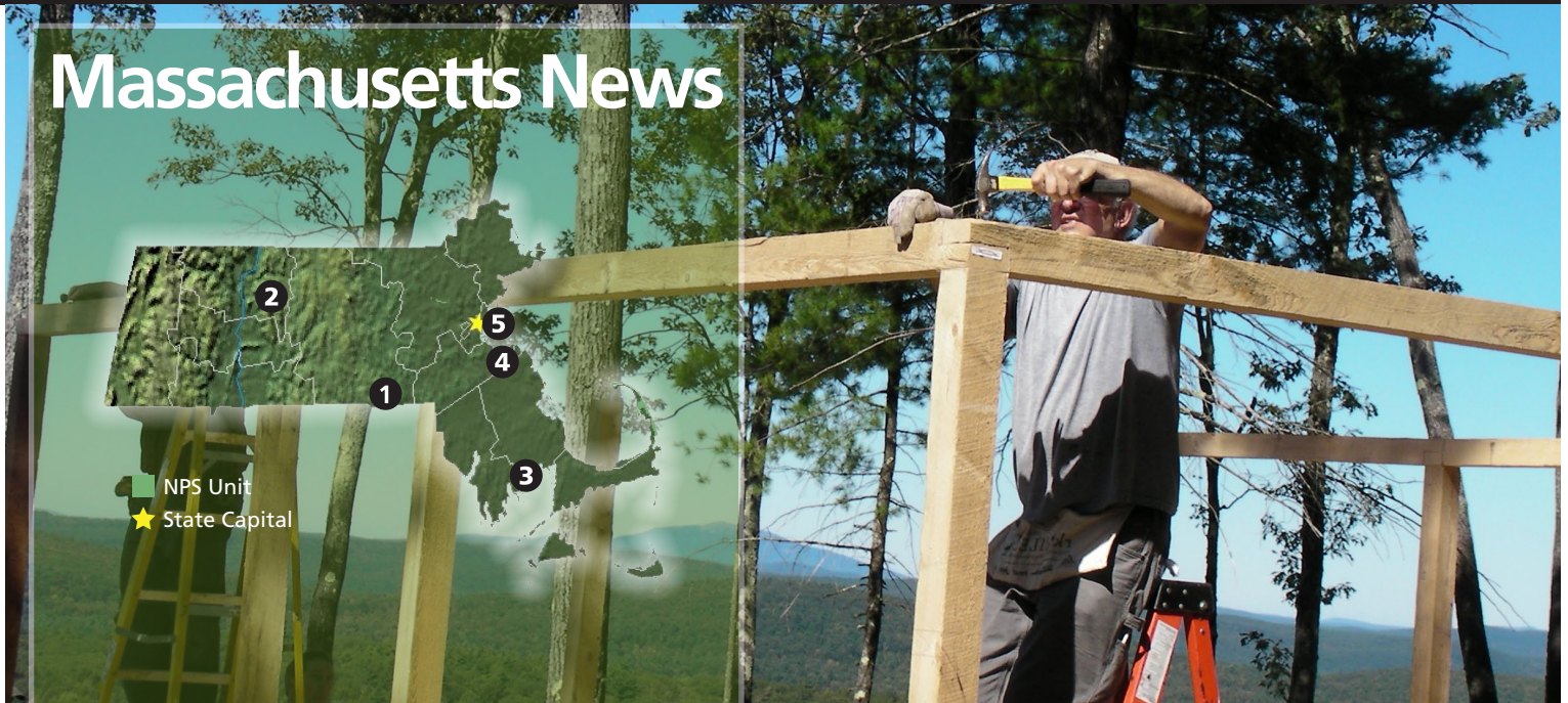
Building a new cabin on the New England National Scenic Trail in Northfield